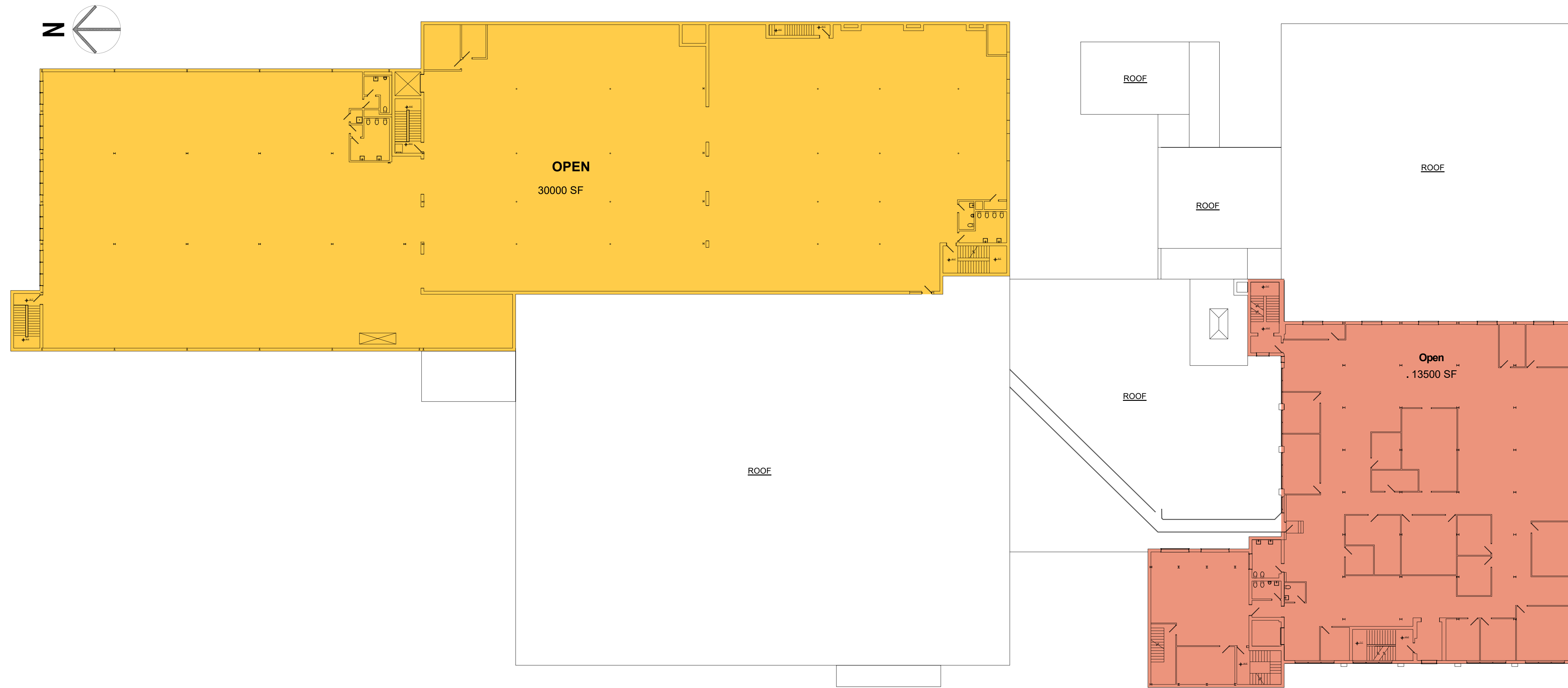
SECOND FLOOR - AREA USE PLAN SCALE: 1" = 20'-0"