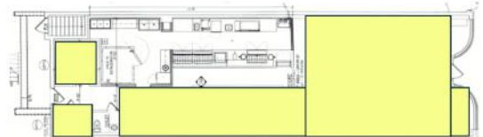
Shared Store - 1,300sf