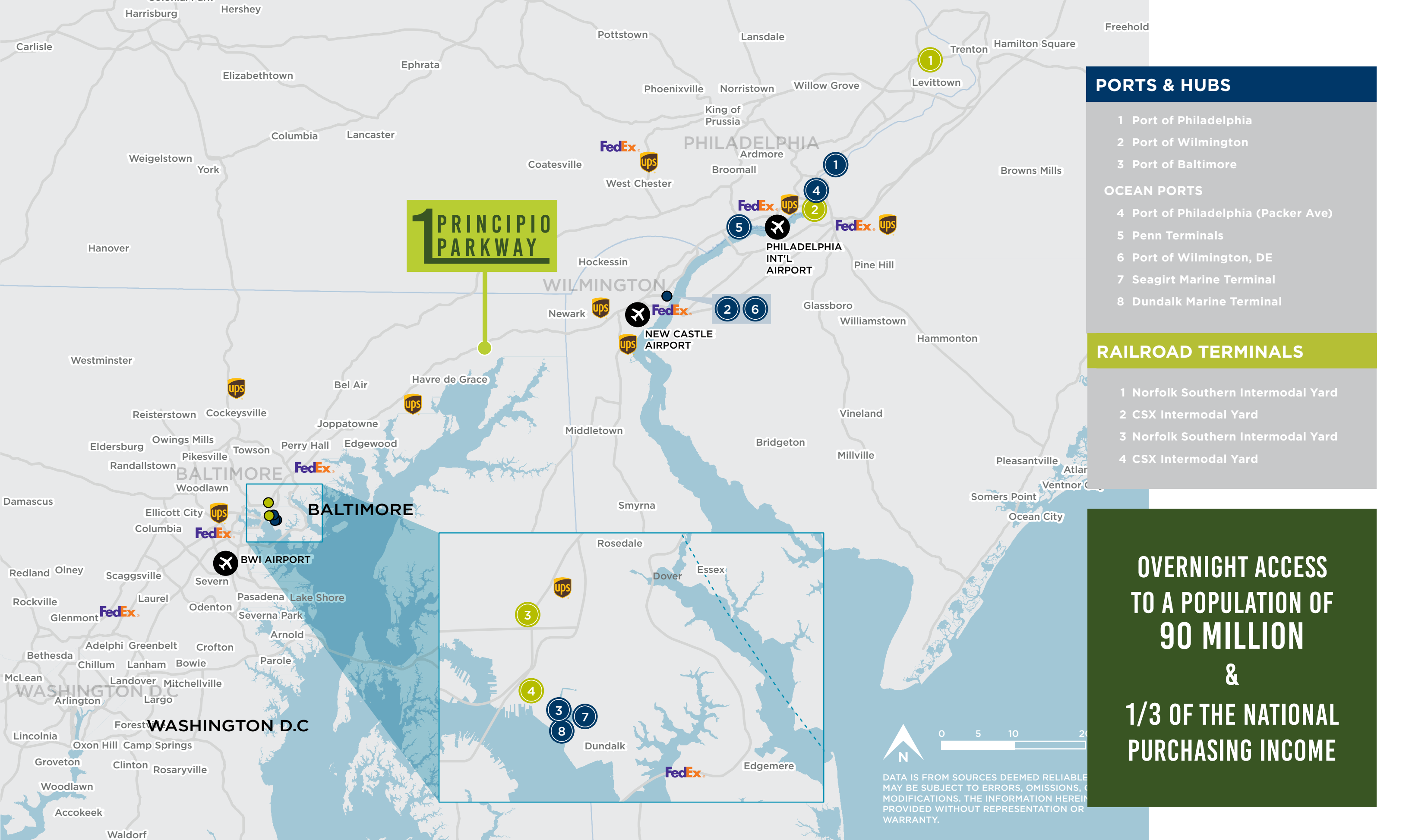
TRANSPORTATION INFRASTRUCTURE MAP