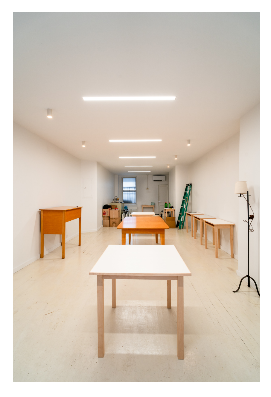
46 Carmine Street Retail For Lease