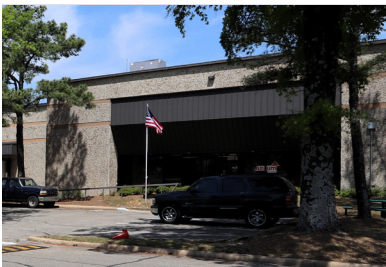
Building D 4440 S Mendenhall Rd