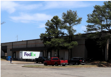
Building E 4444 S Mendenhall Rd