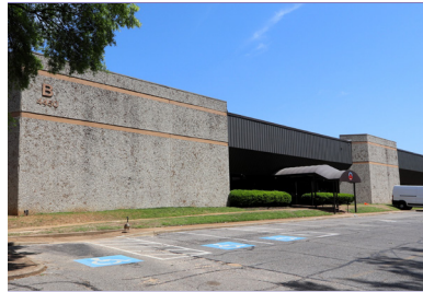
Building B 4450 S Mendenhall Rd