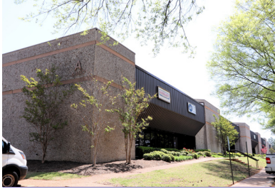
Building A 4400 S Mendenhall Rd