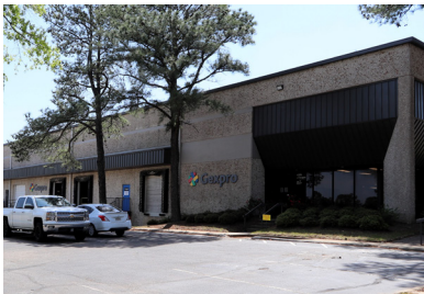
Building C 4370 S Mendenhall Rd