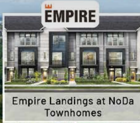
Empire Landings at NoDa Townhomes