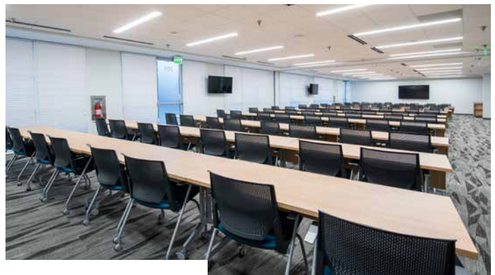
TENANT LOUNGE AND SHARED CONFERENCING