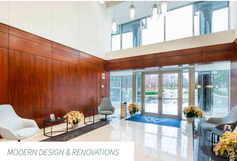
MODERN DESIGN & RENOVATIONS