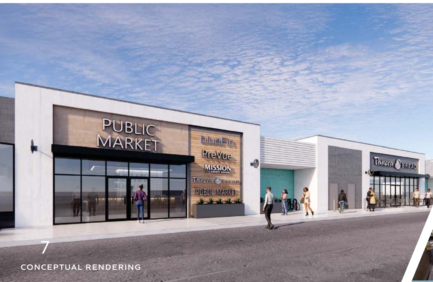
7 CONCEPTUAL RENDERING