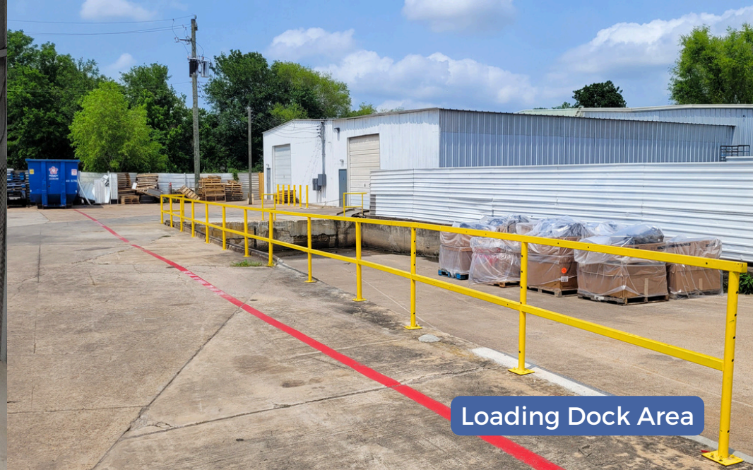
Loading Dock Area