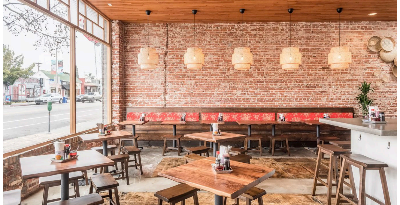
Joy. Taiwanese classics get a hip twist at this Highland Park eatery from the Pine & Crane team.