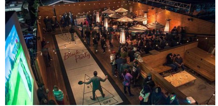
Block Party. Buzzing neighborhood alehouse with an expansive beer list & lively shuffleboard games on the patio.