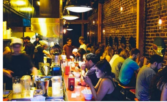
Ramen of York. Ramen noodles, rice bowls, edamame & other Japanese fare offered in a narrow, casual & bustling space.