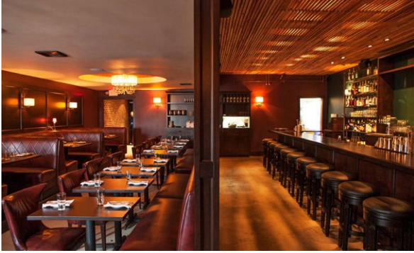
Sonny's Hideaway. Artsy haunt featuring rotating draft beers, wine & creative spins on global bar bites.