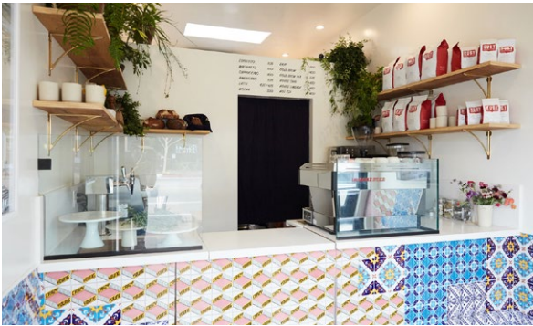
Collage Coffee. Boutique coffee shop selling drop coffee to cold brew tea as well as waffles and Goat Cheese toast.