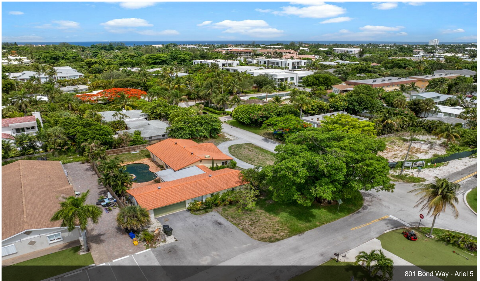
801 Bond Way - Ariel 5