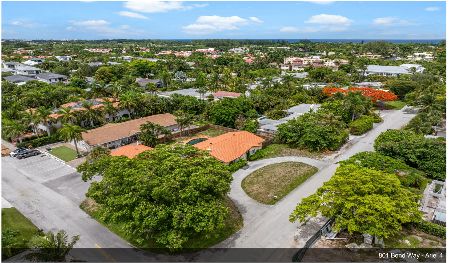
801 Bond Way - Ariel 4