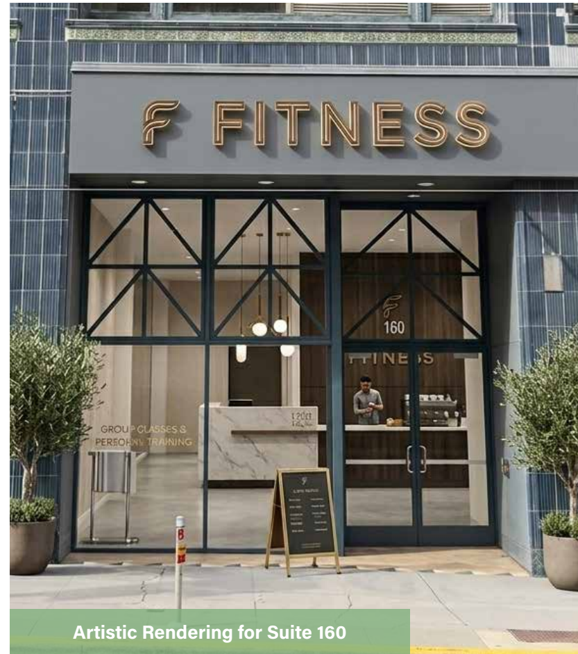
Artistic Rendering for Suite 160