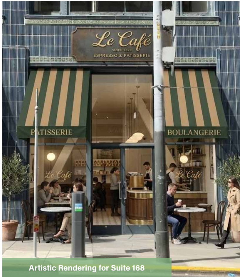
Artistic Rendering for Suite 168