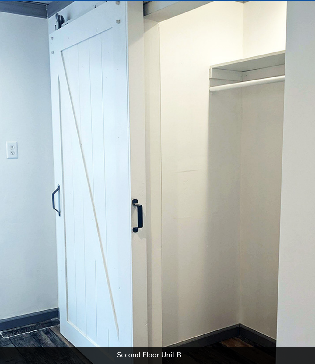
Second Floor Unit B