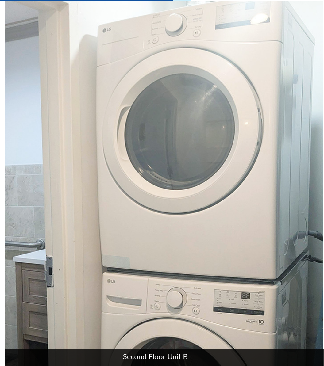
Second Floor Unit B

JOSEPH LATINA, SIOR Managing Principal O: 302.530.1233 | C: 302.414.1000 jlatina@LMTCRE.com