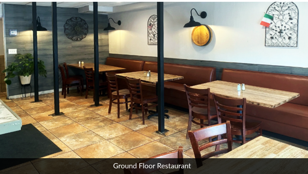
Ground Floor Restaurant

JOSEPH LATINA, SIOR Managing Principal O: 302.530.1233 | C: 302.414.1000 jlatina@LMTCRE.com