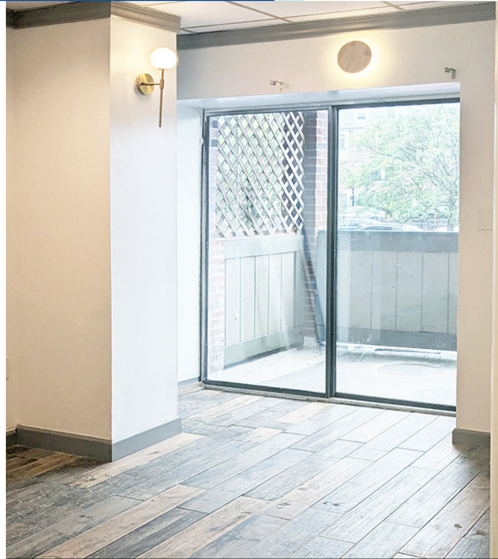
Second Floor Unit B

JOSEPH LATINA, SIOR Managing Principal O: 302.530.1233 | C: 302.414.1000 jlatina@LMTCRE.com