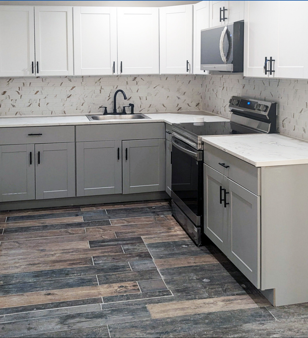
Second Floor Unit B