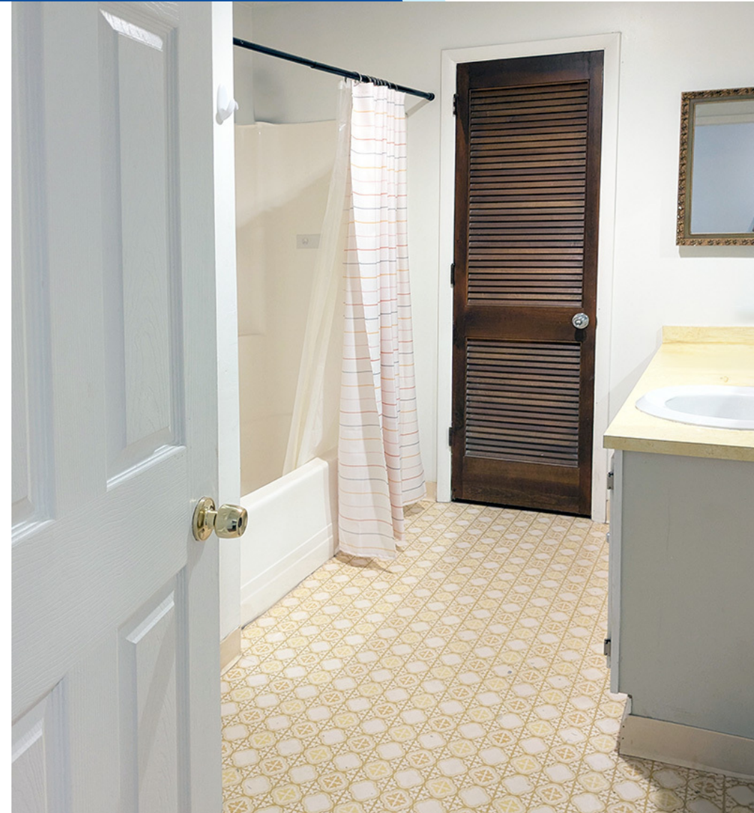
Third Floor Unit C

JOSEPH LATINA, SIOR Managing Principal O: 302.530.1233 | C: 302.414.1000 jlatina@LMTCRE.com