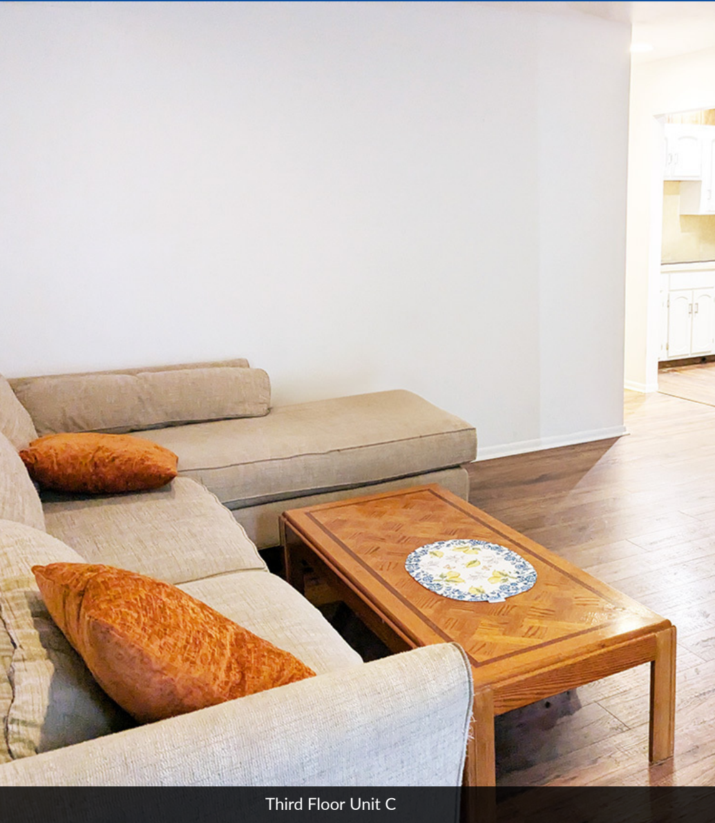
Third Floor Unit C