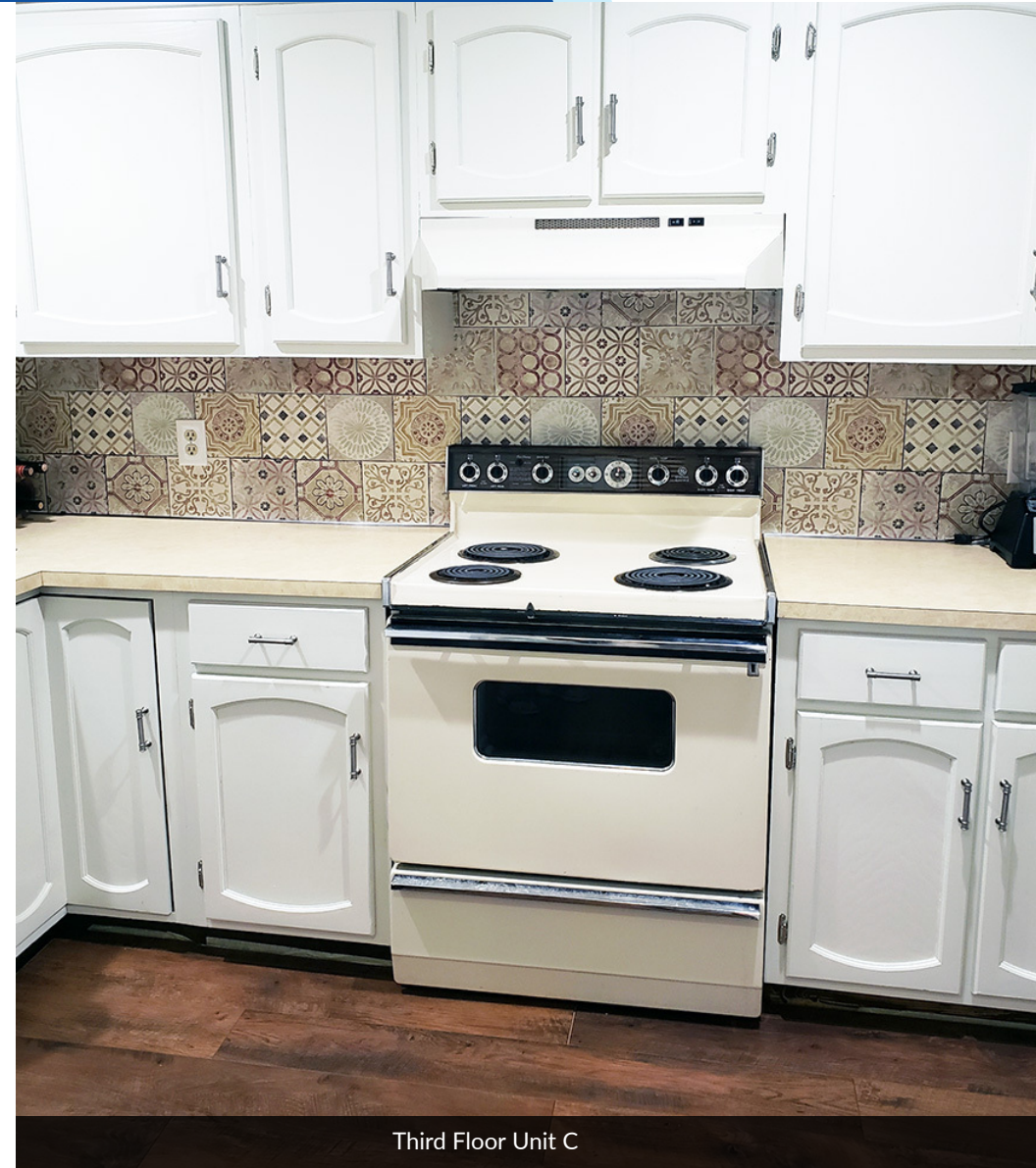
Third Floor Unit C

JOSEPH LATINA, SIOR Managing Principal O: 302.530.1233 | C: 302.414.1000 jlatina@LMTCRE.com