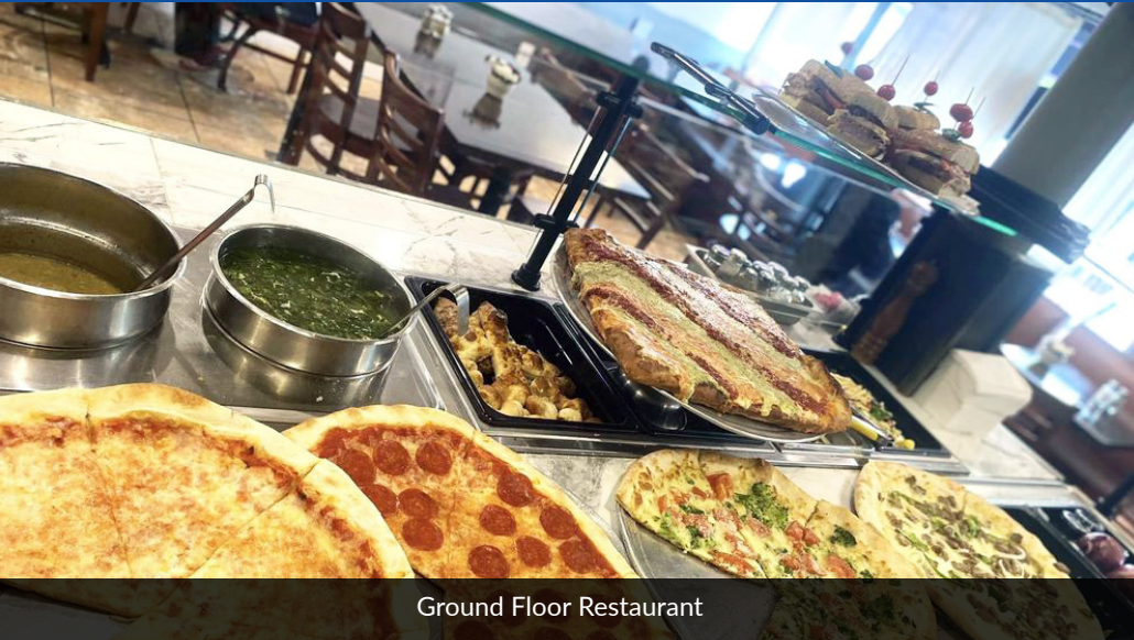
Ground Floor Restaurant