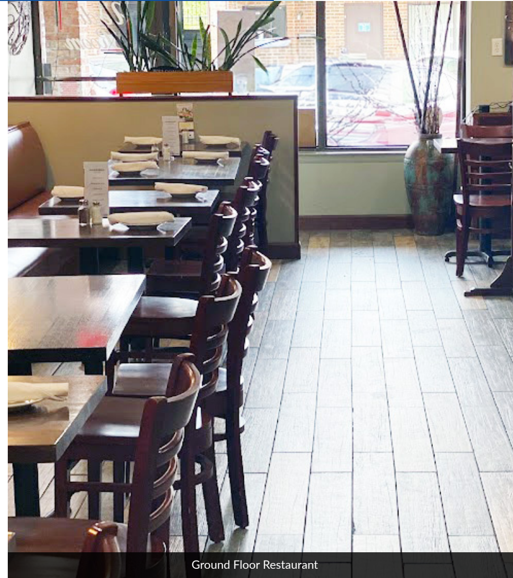
Ground Floor Restaurant