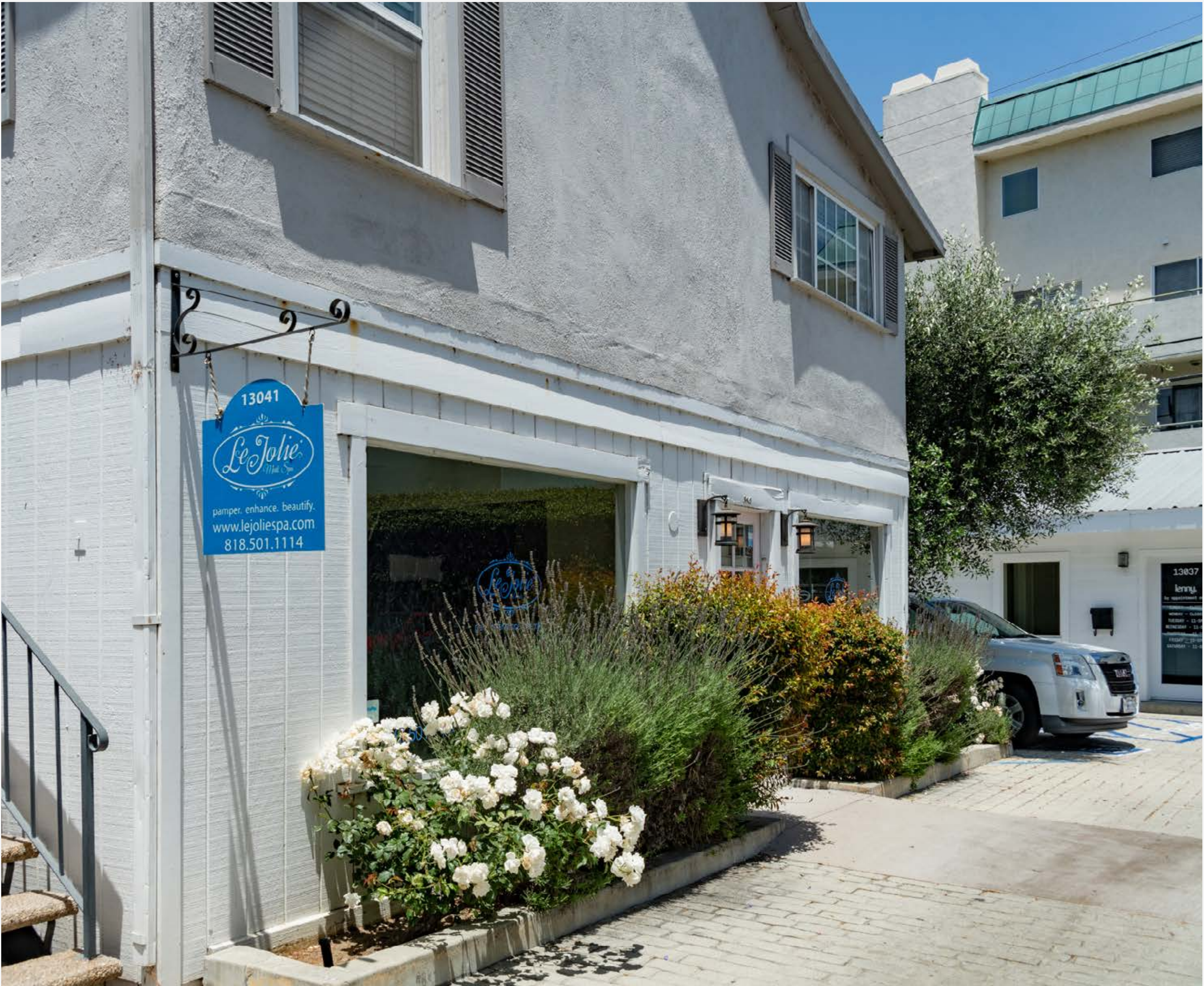
13041 & 13403 Ventura Blvd.