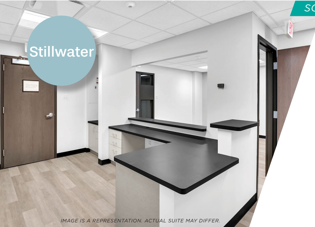
IMAGE IS A REPRESENTATION. ACTUAL SUITE MAY DIFFER.