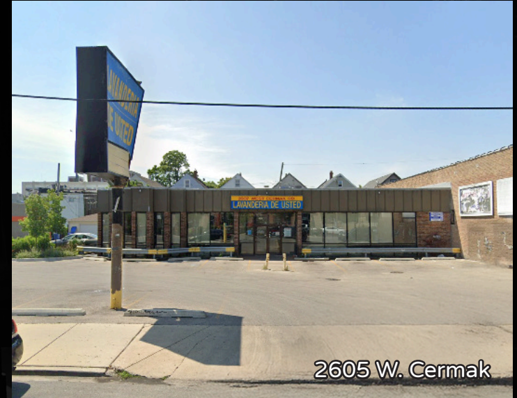
2605 W. Cermak