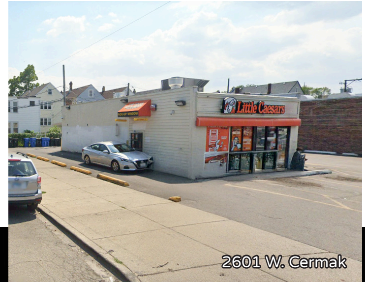
2601 W. Cermak