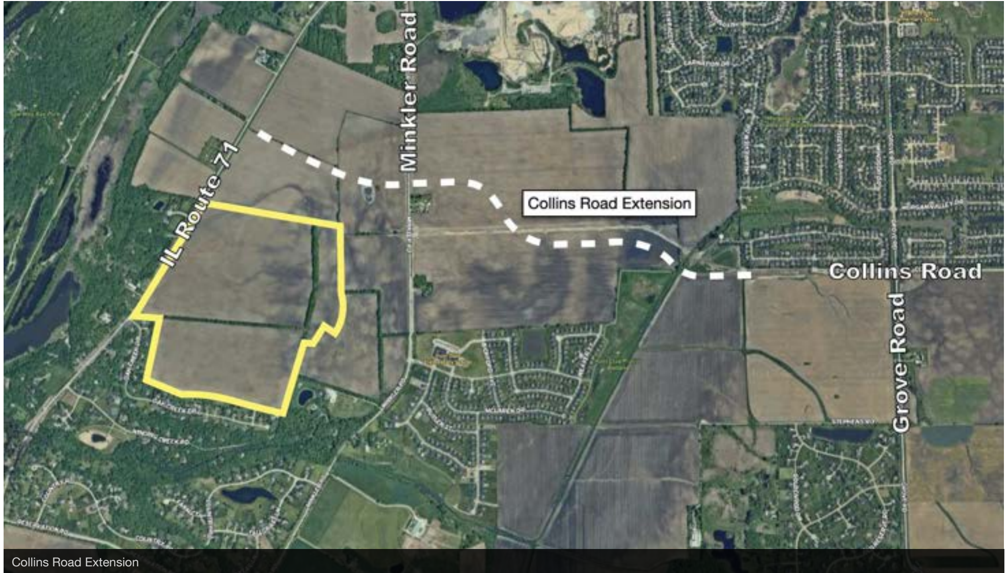
Collins Road Extension

john greene Real Estate | 1311 S Route 59, Naperville, IL 60564 | 630.229.2290