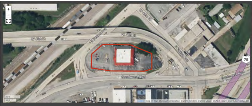
TRAFFIC COUNT - SOURCE INCOG 2024

BAUER & ASSOCIATES, REALTORS® "A LEADER IN TULSA COMMERCIAL REAL ESTATE SINCE 1979" Commercial - Industrial - Investment Property - Property Management