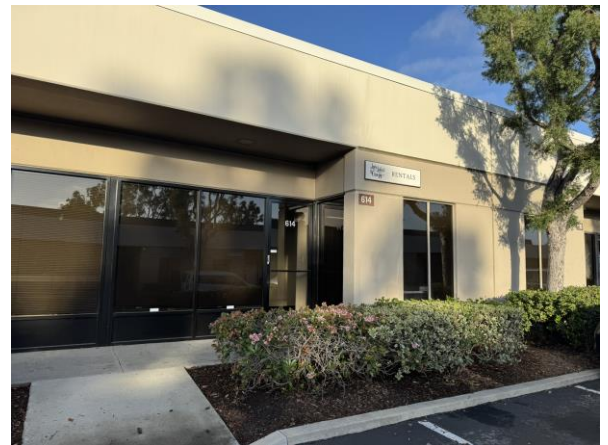
Flex Warehouse with Office