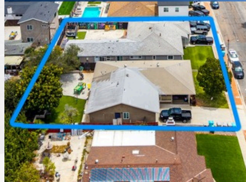
5602 & 5610 Dorothy Dr | Offering Memorandum