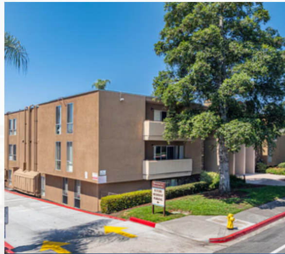
College Campanile Apartments San Diego, CA 92115