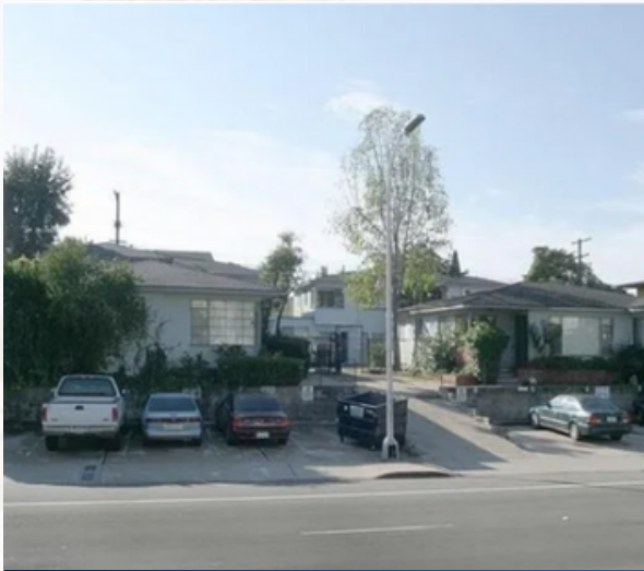
6181-91 Montezuma Rd, San Diego CA 92115