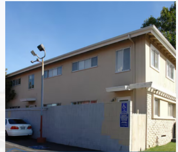
5065-77 College Ave Sand Diego, CA 92115