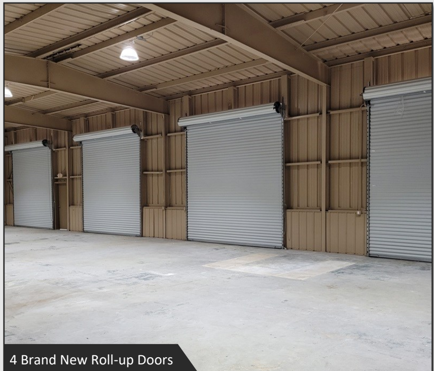
4 Brand New Roll-up Doors