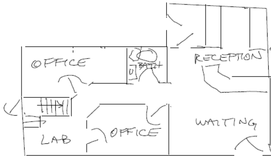
MAIN LEVEL (NOT TO SCALE)