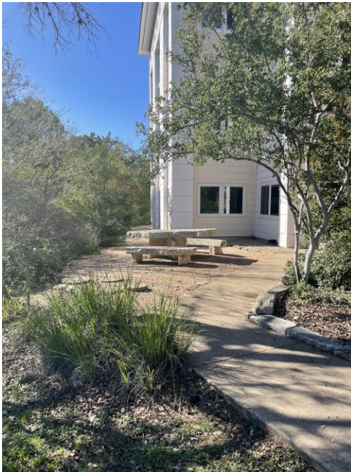
Scenic break area