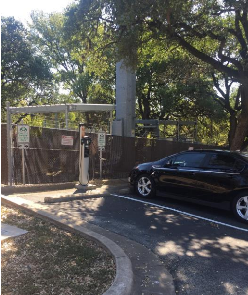
EV Charging Station onsite