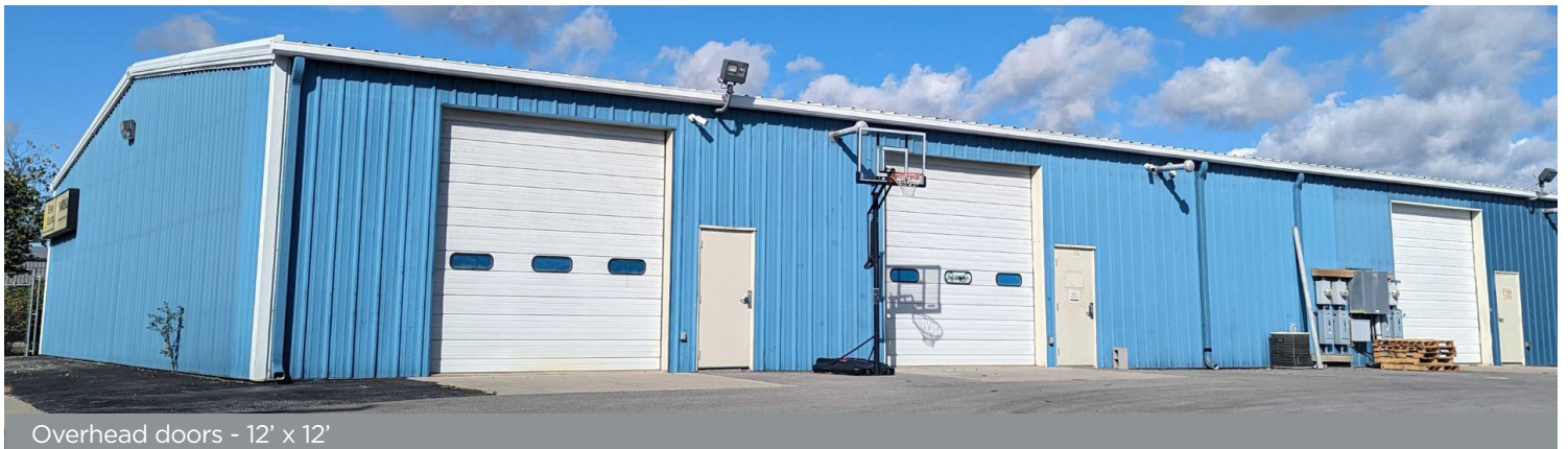
Overhead doors - 12' x 12'