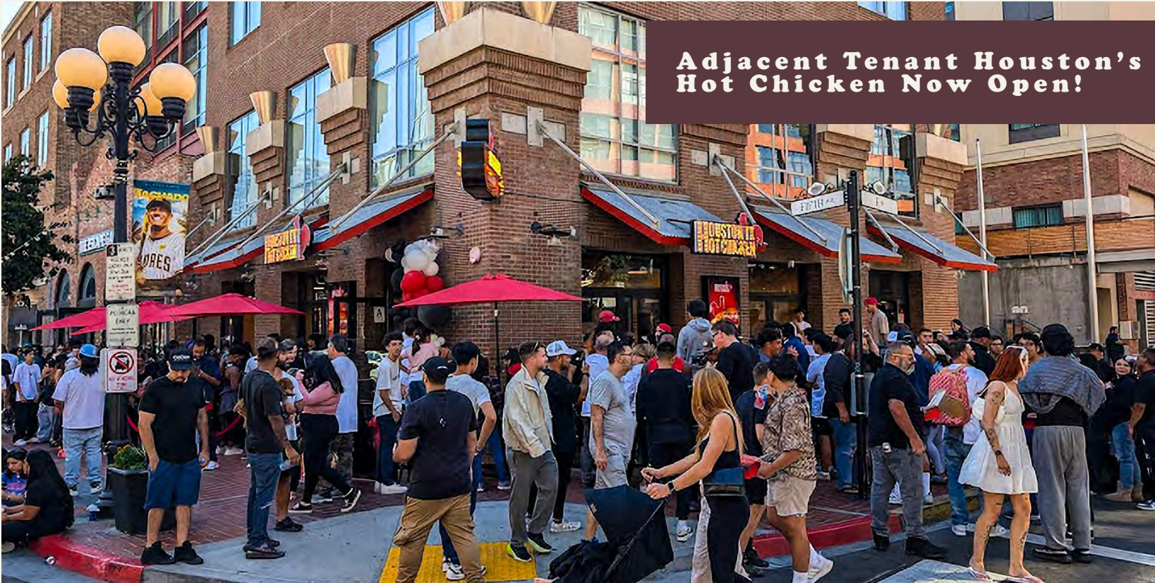
Adjacent Tenant Houston's Hot Chicken Now Open!