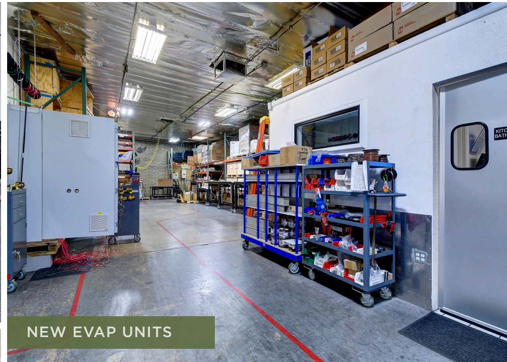
NEW EVAP UNITS