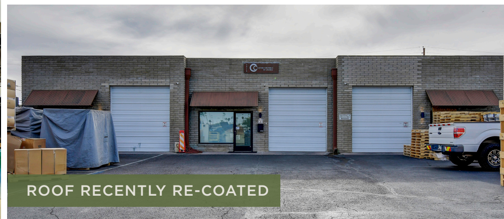
ROOF RECENTLY RE-COATED