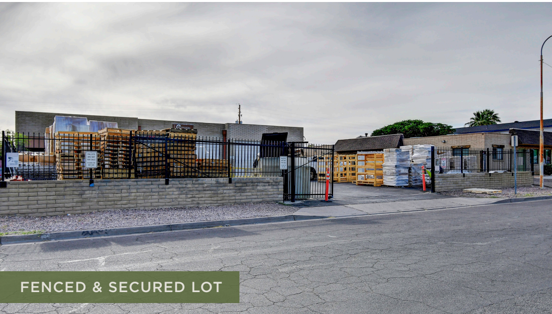
FENCED & SECURED LOT