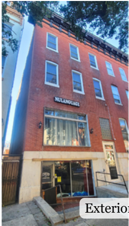
Exterior of Building

Own a piece of Baltimore's creative core—where thriving businesses meet historic charm. 2112 North Charles Street is a flexible investment in a growing urban hub.