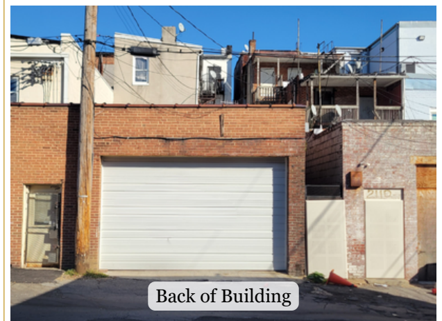
Back of Building