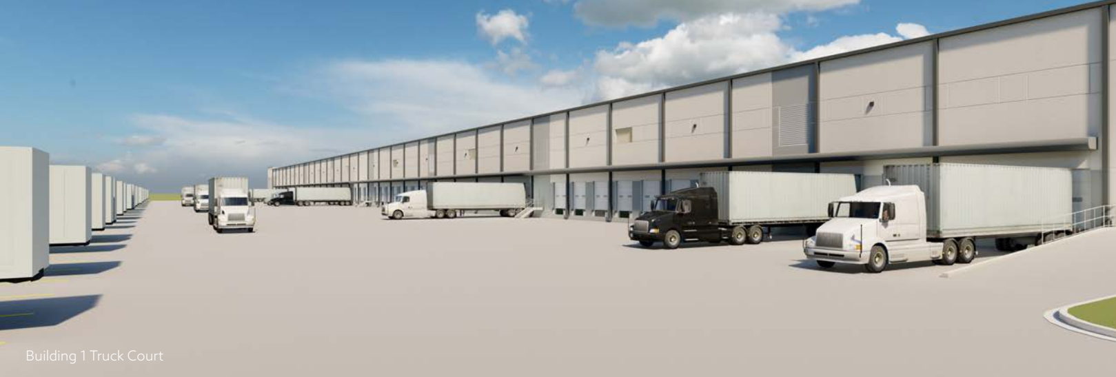
Building 1 Truck Court