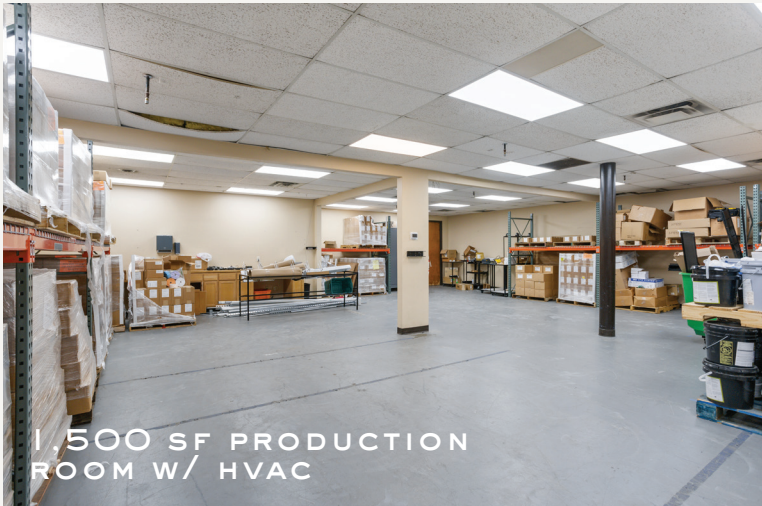
1,500 SF PRODUCTION ROOM W/ HVAC