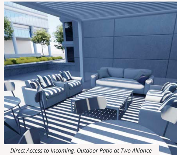
Direct Access to Incoming, Outdoor Patio at Two Alliance