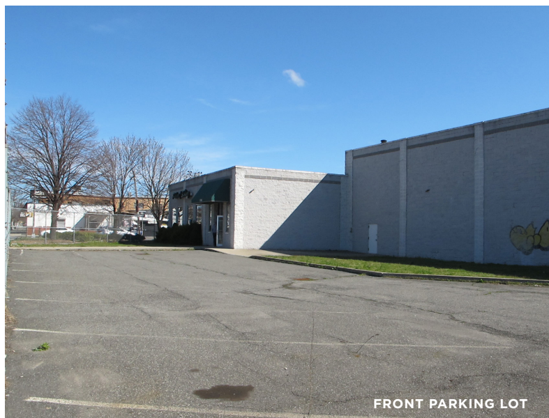
FRONT PARKING LOT