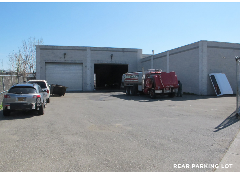
REAR PARKING LOT