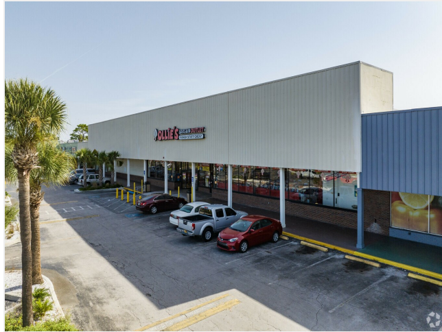
Bayonet Square is Surrounded by National Retailers, Food Chains, and Restaurants