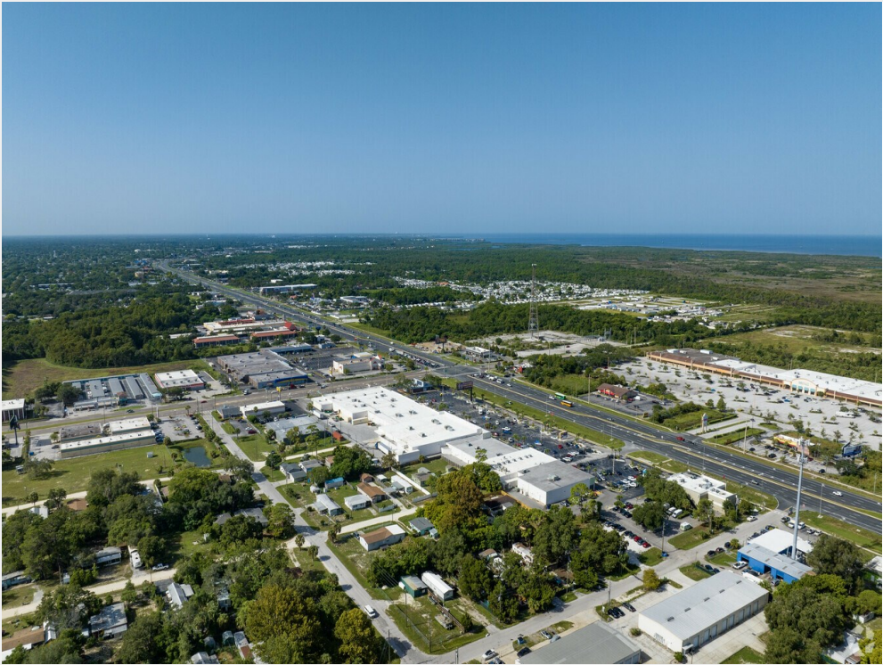
Positioned at a Signalized Intersection with Exceptional Visibility