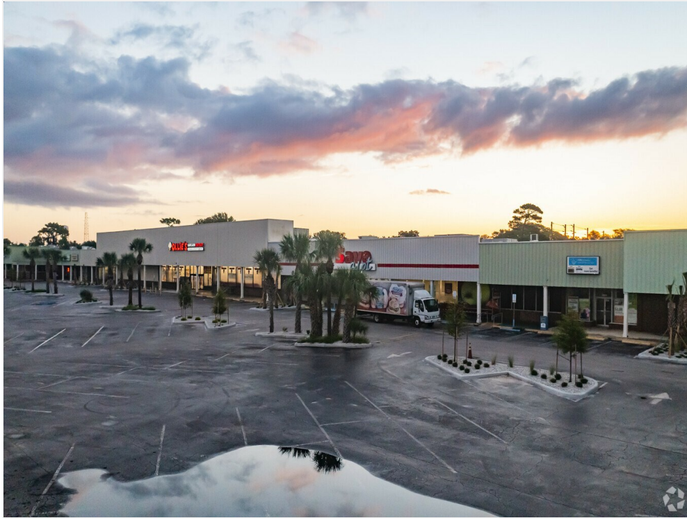
Highly Visible Shopping Center Anchored by Harbor Freight, Ollies, and Save-A-Lot