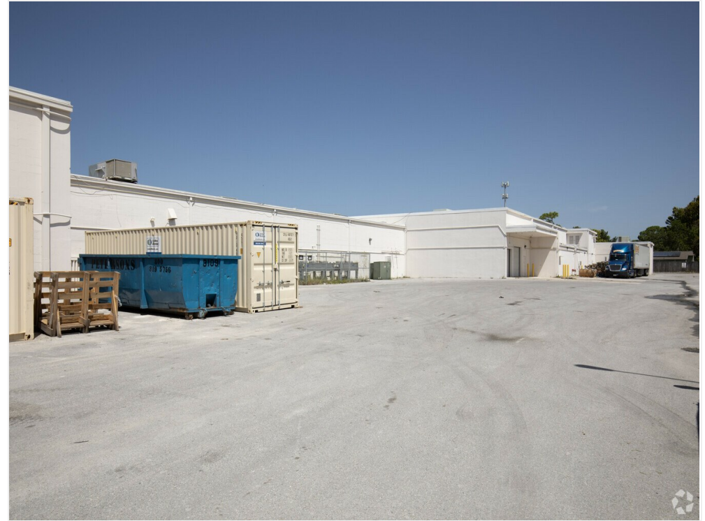
Bayonet Square is Surrounded by National Retailers, Food Chains, and Restaurants