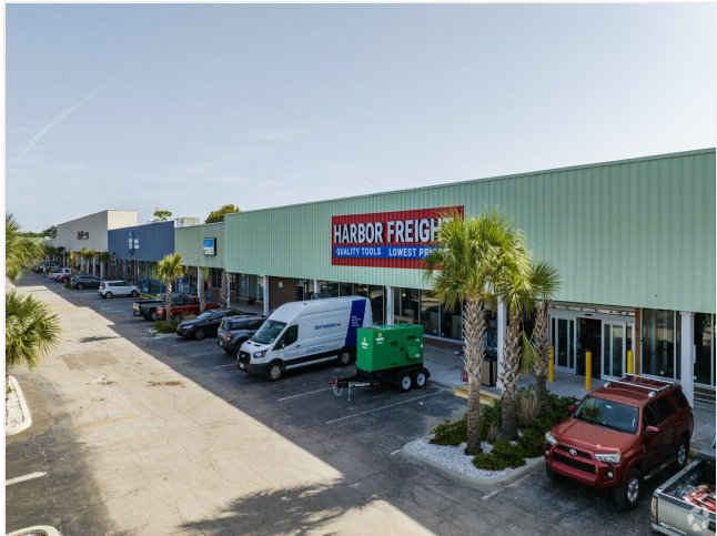
Highly Visible Shopping Center Anchored by Harbor Freight, Ollies, and Save-A-Lot