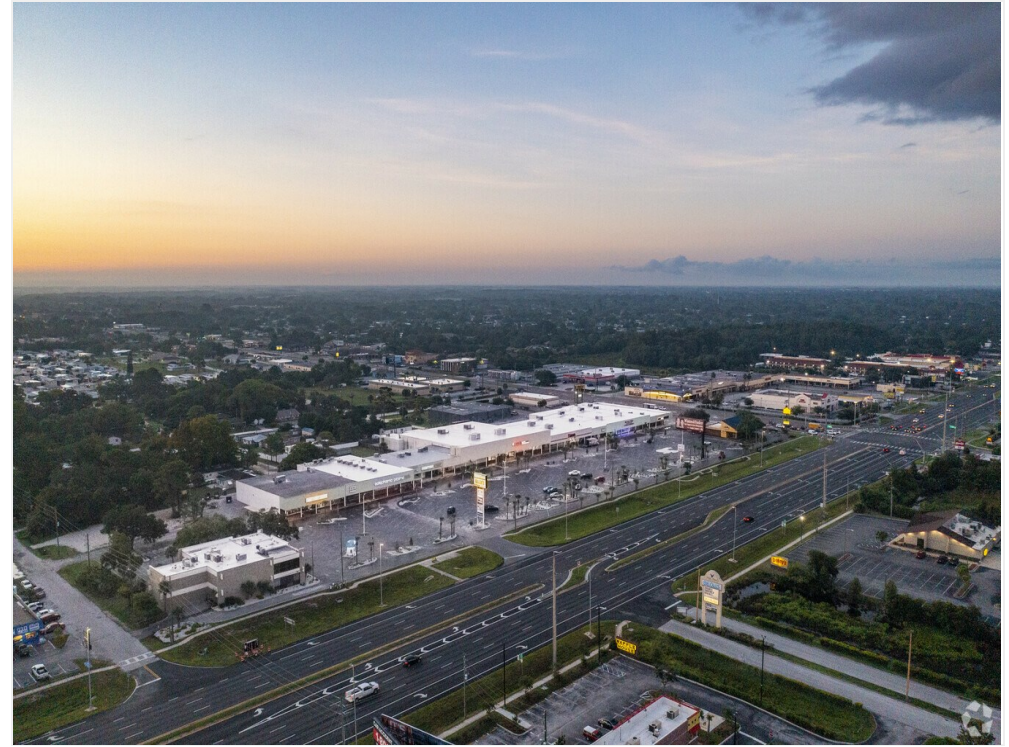
Positioned at a Signalized Intersection with Exceptional Visibility