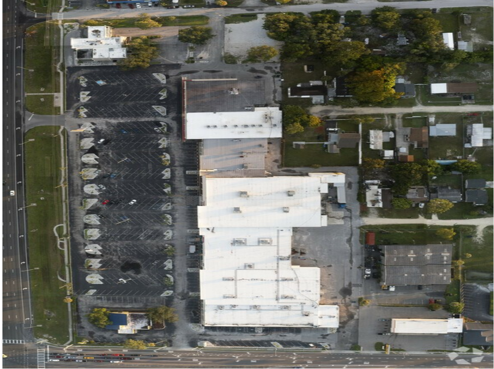
Positioned at a Signalized Intersection with Exceptional Visibility