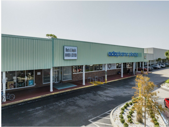
Available Suites are Perfect for Retail, Health and Wellness, Restaurants, and More