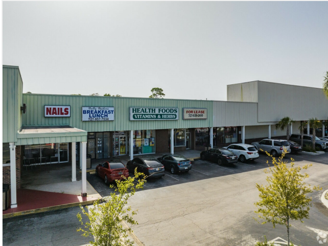
Bayonet Square is Surrounded by National Retailers, Food Chains, and Restaurants