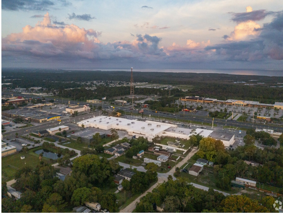
Positioned at a Signalized Intersection with Exceptional Visibility