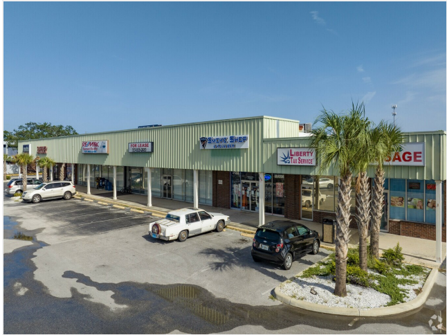
Highly Visible Shopping Center Anchored by Harbor Freight, Ollies, and Save-A-Lot