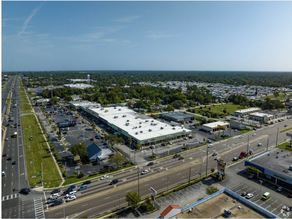
Positioned at a Signalized Intersection with Exceptional Visibility