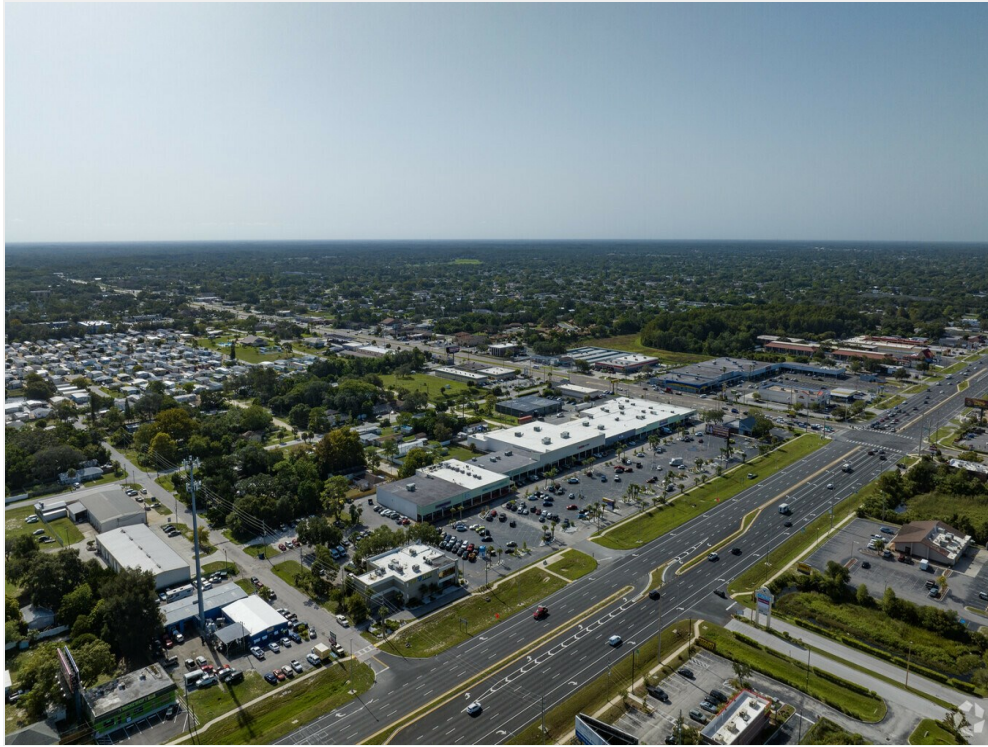
Positioned at a Signalized Intersection with Exceptional Visibility