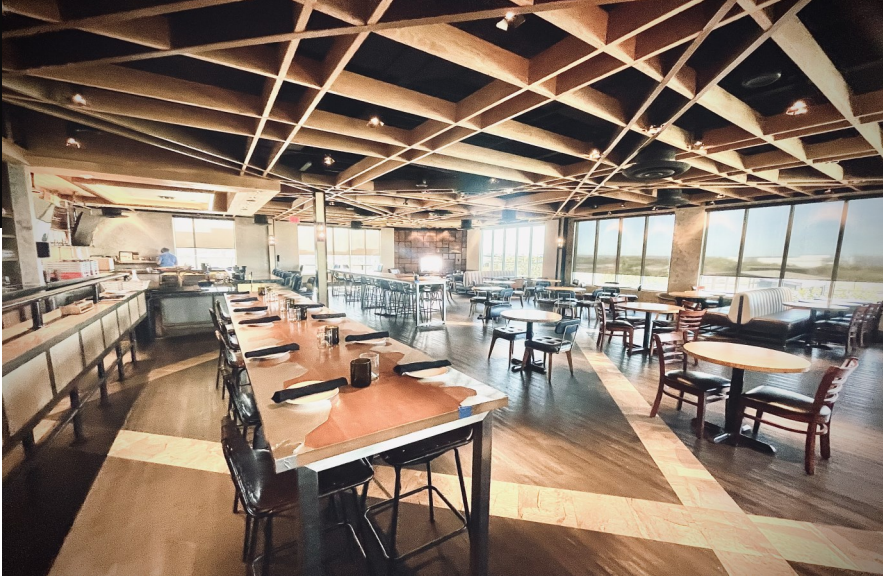
Bar-side Fine Dining High Tops