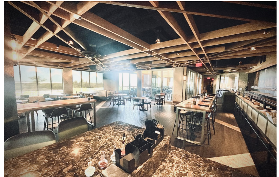
Bar-side High Top Patio View