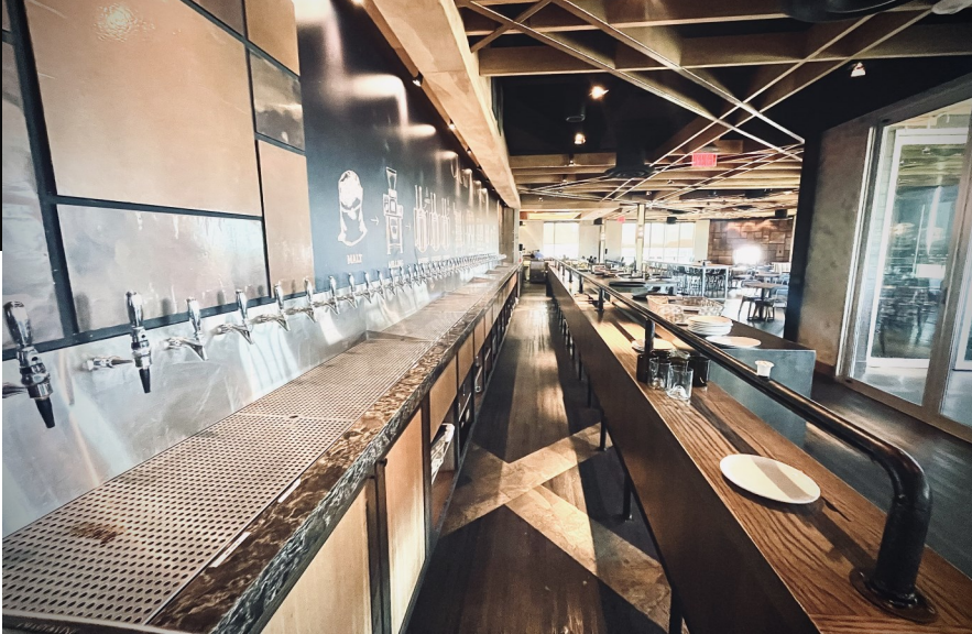
Elegant Bar with Beer or Wine Taps