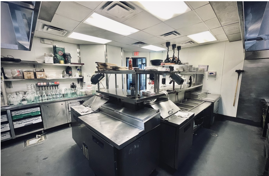
Commercial Kitchen Prep Station