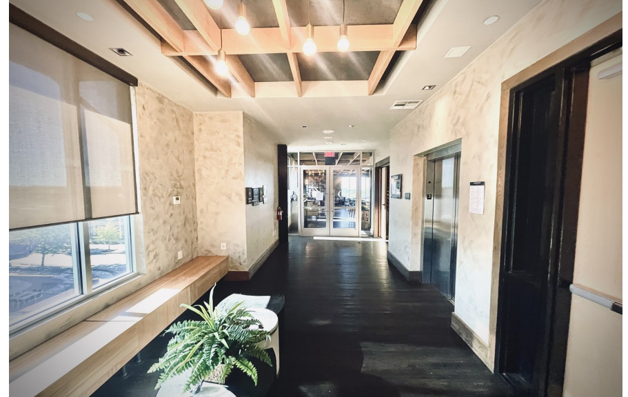
Temperate, Dedicated Main Lobby Waiting Area