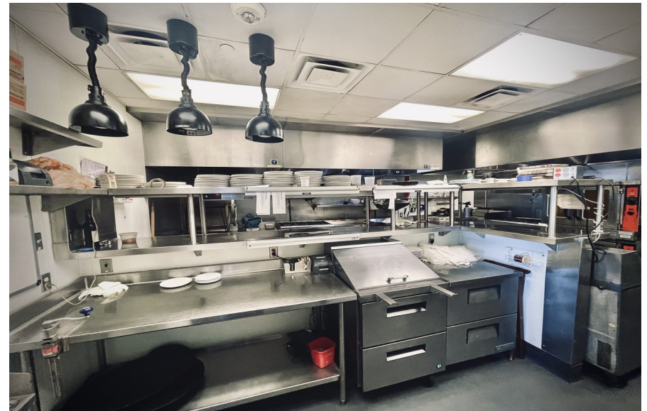
Commercial Prep Station, Alternate Angle