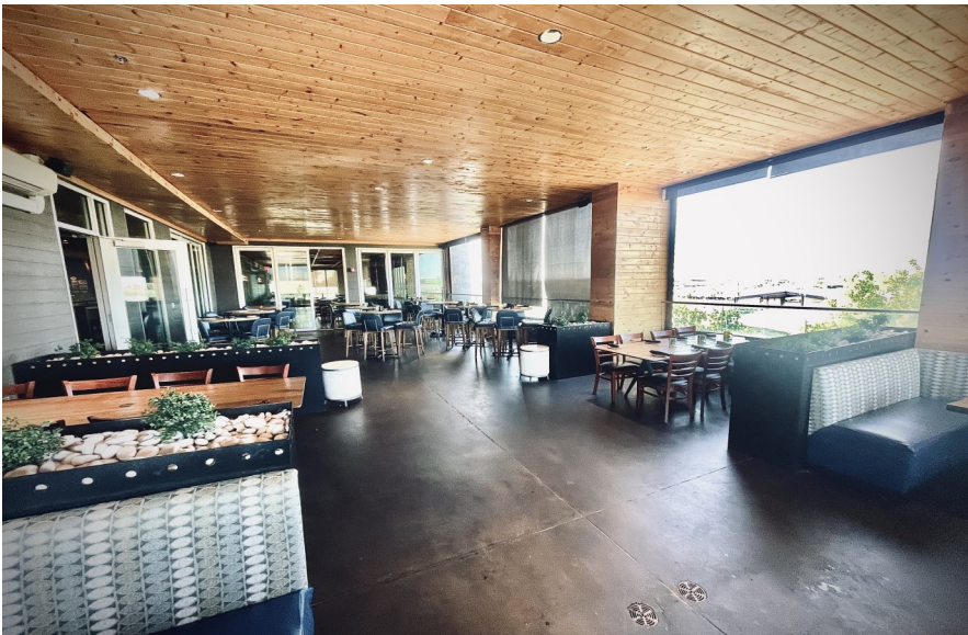
Heated and Cooled Scenic-view Patio