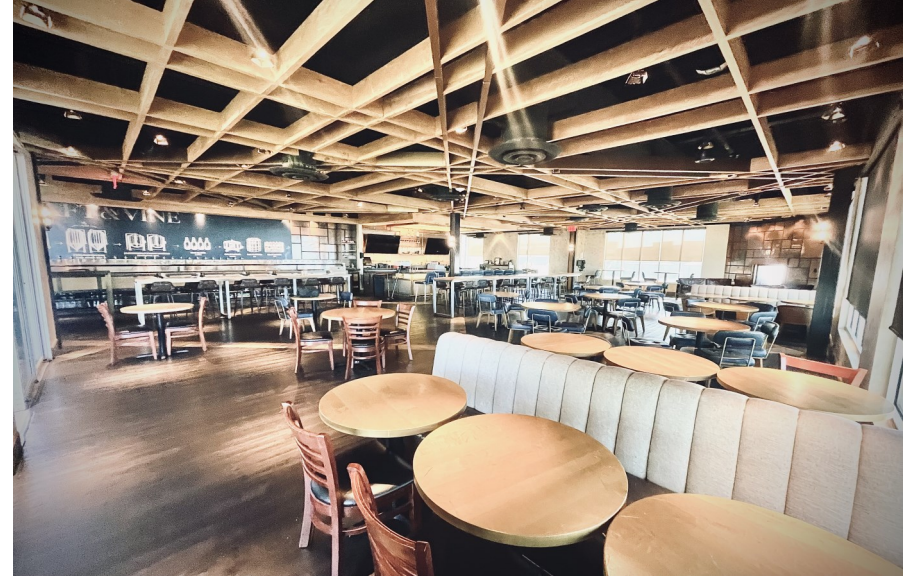
Sunset-view Booth Seating