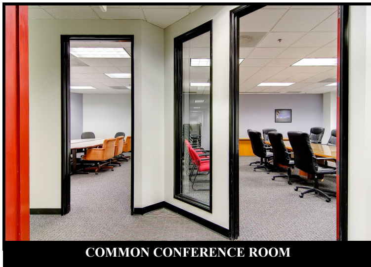
COMMON CONFERENCE ROOM