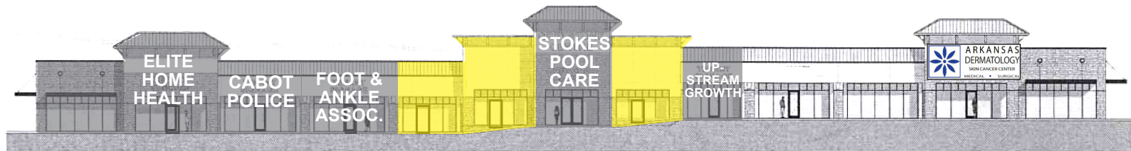
2 EAST ELEVATION 3/32"=1'-0" 0.8.09