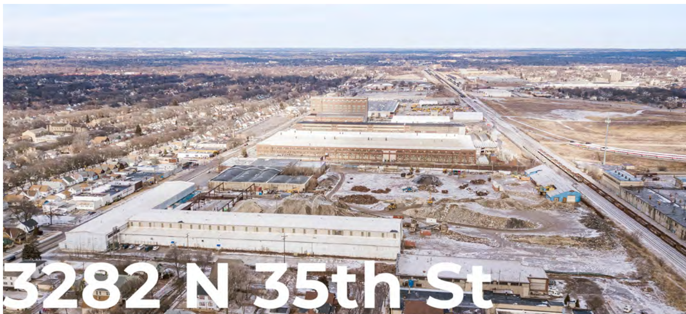
Milwaukee, WI 53210