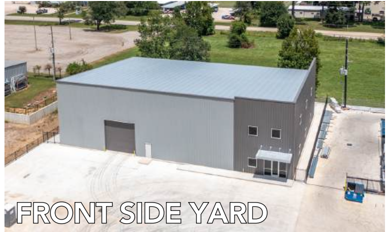
FRONT SIDE YARD