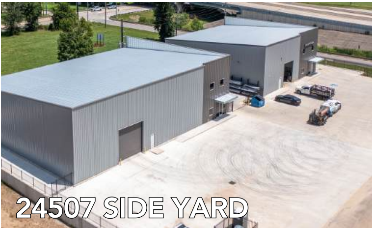
24507 SIDE YARD