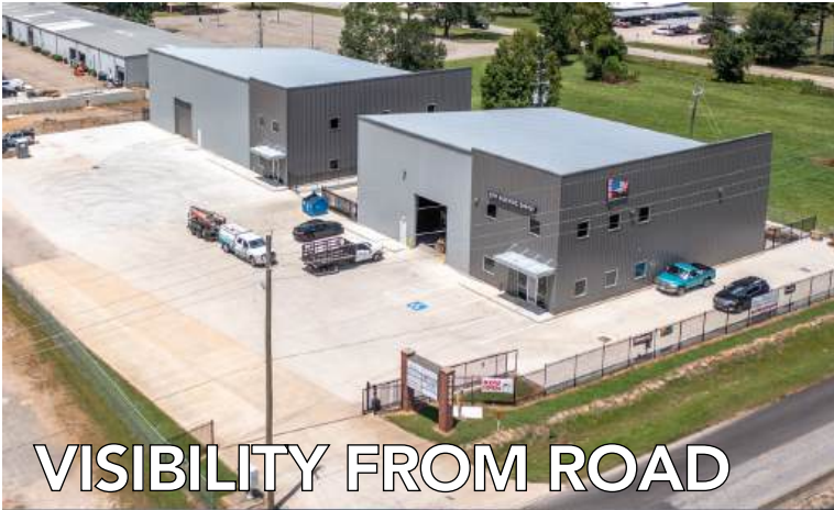
VISIBILITY FROM ROAD