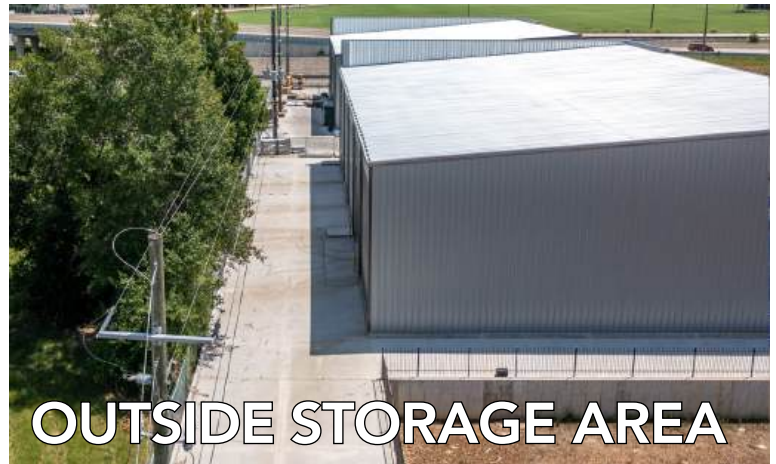
OUTSIDE STORAGE AREA