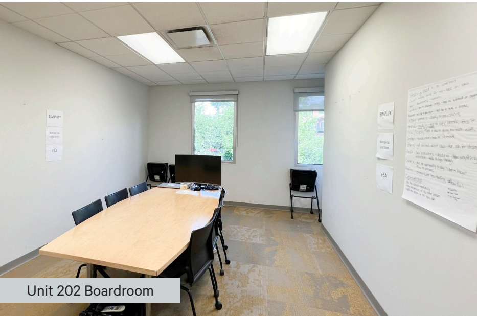
Unit 202 Boardroom