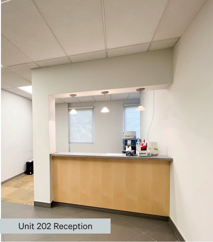
Unit 202 Reception