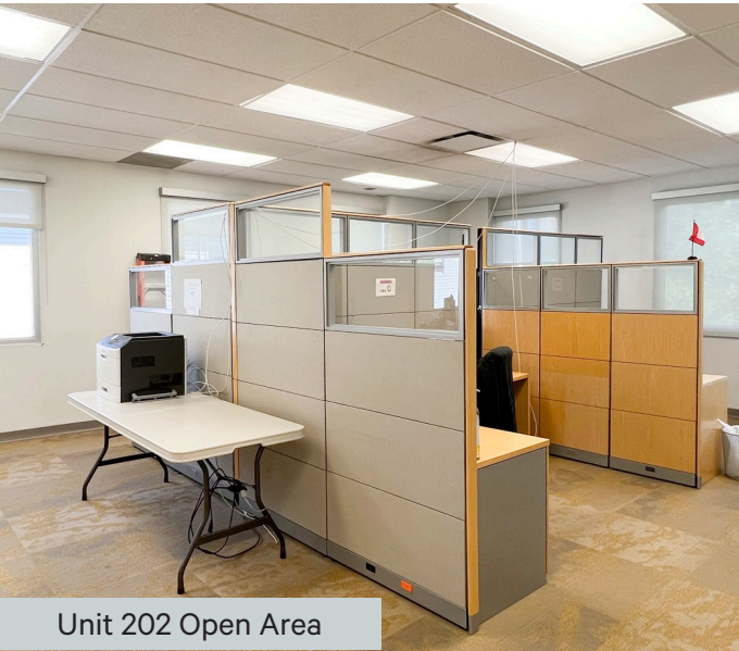
Unit 202 Open Area