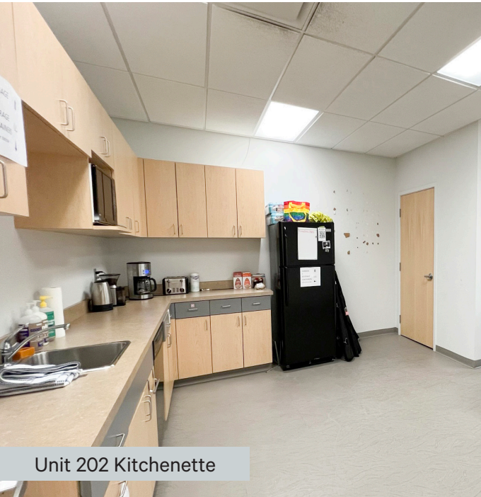
Unit 202 Kitchenette