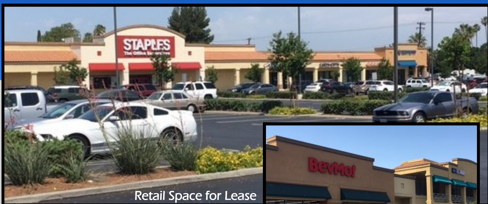
Retail Space for Lease