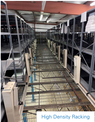
High Density Racking