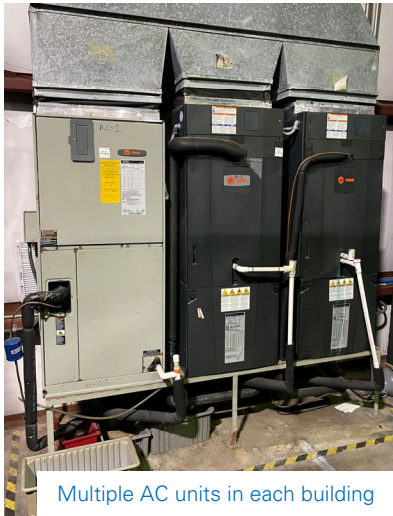
Multiple AC units in each building