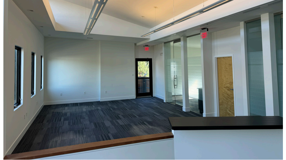
Reception/ Open Office Area