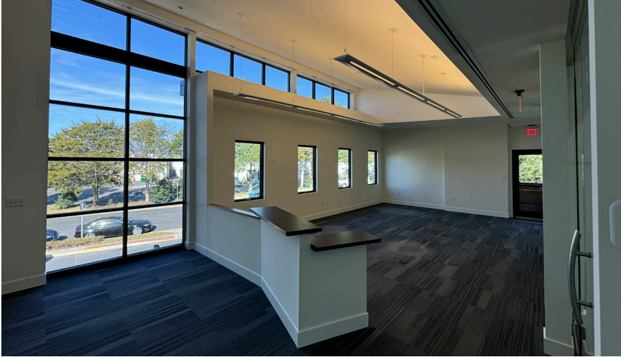
Reception/ Open Office Area