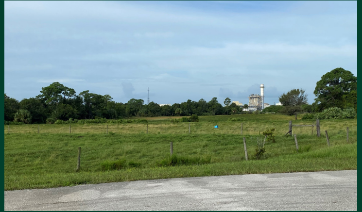
Build to Suit Concept Plan