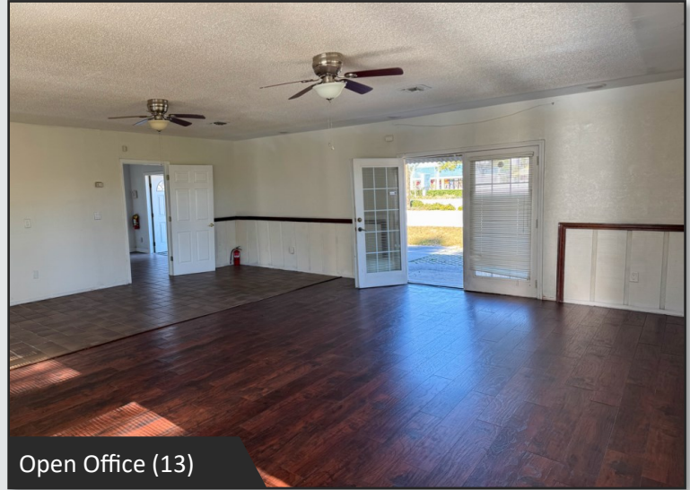
Open Office (13)