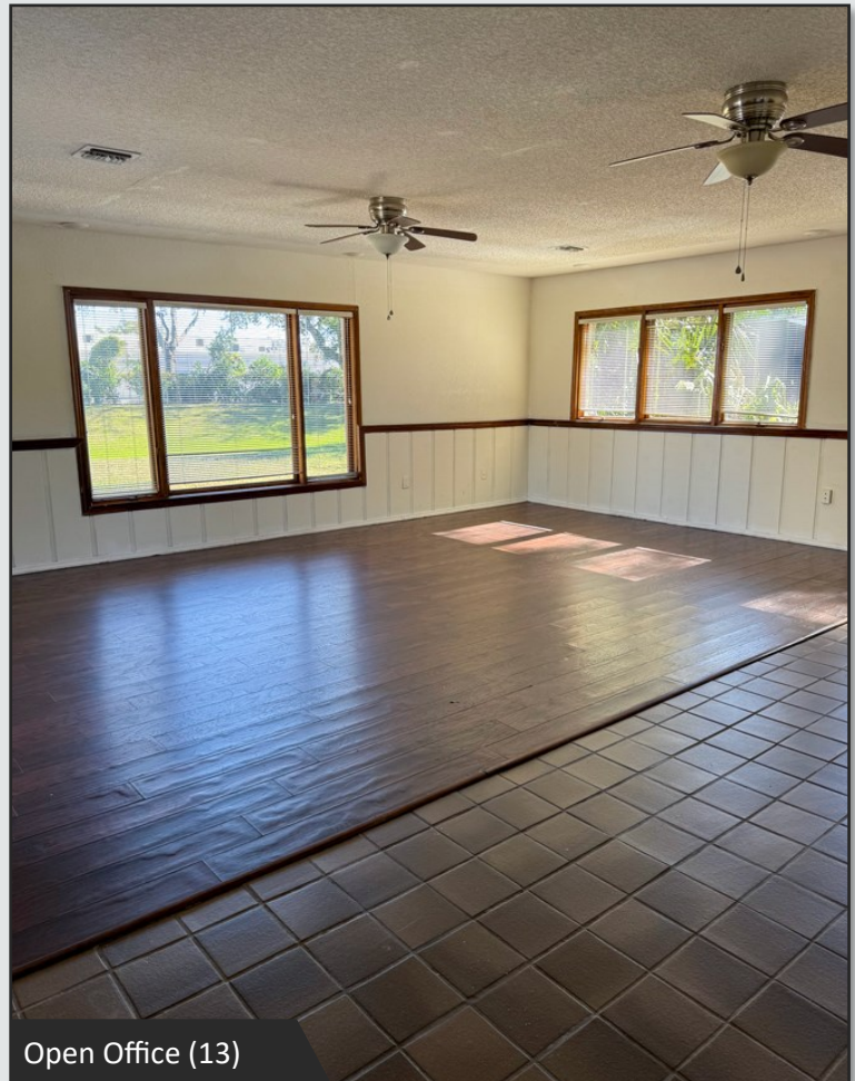
Open Office (13)