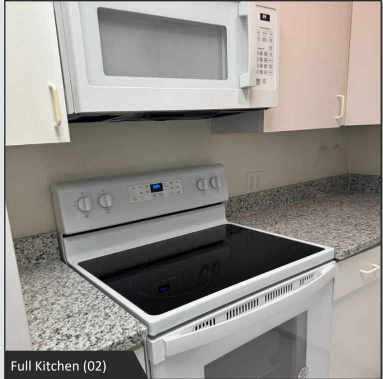
Full Kitchen (02)