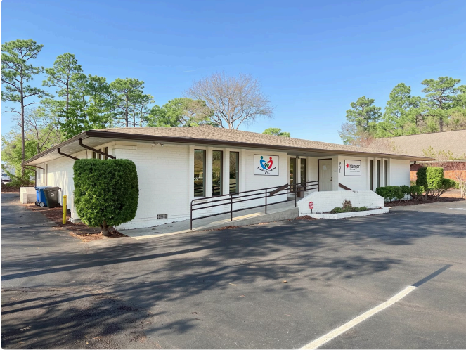
Side Building View Unit A