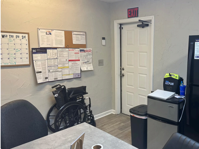
Break Room/Side Entrance Unit A