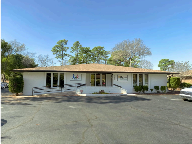
Front Building View