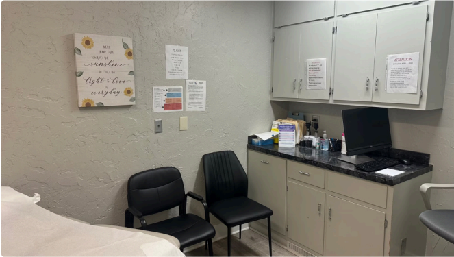
Exam Room Unit A