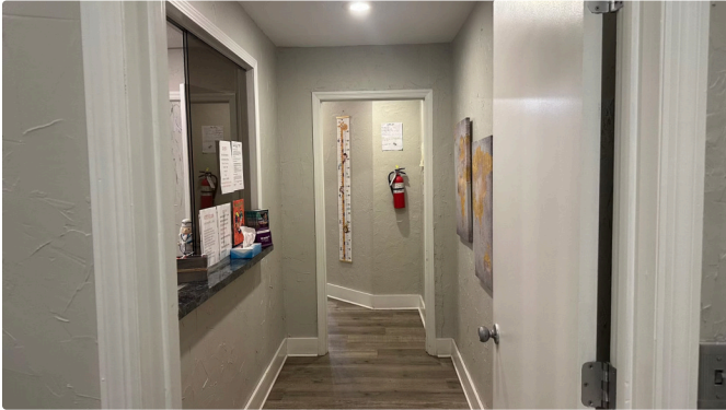
Hallway Unit A