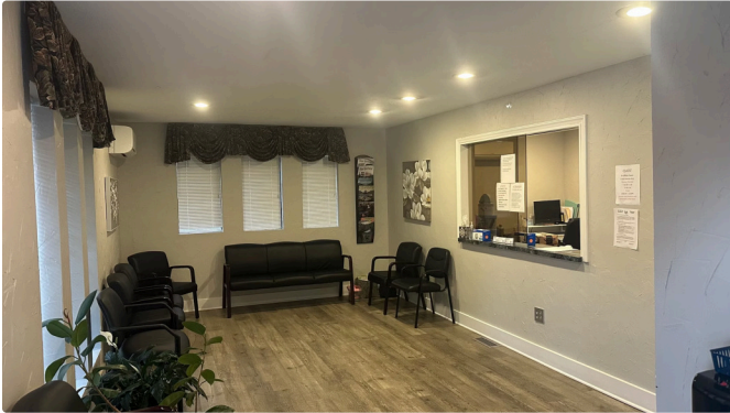
Reception Unit A