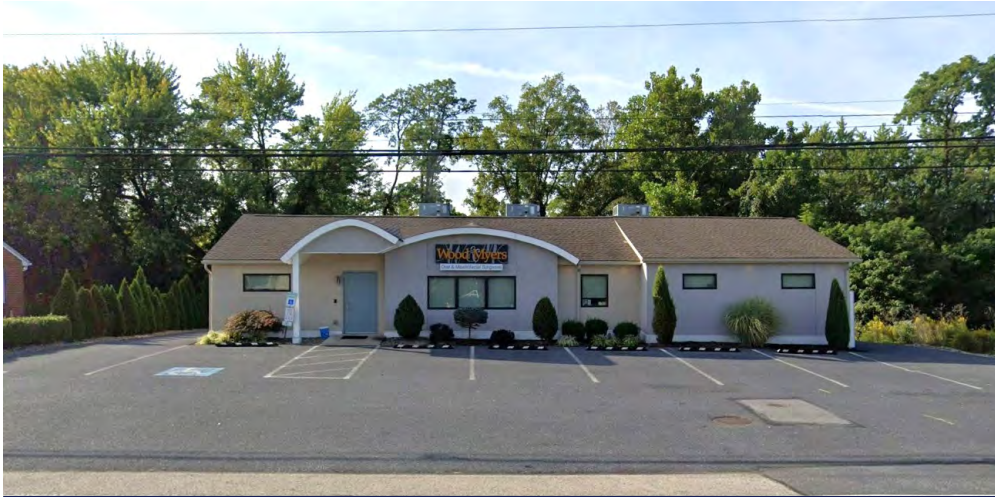
4341 LINGLESTOWN RD, HARRISBURG, PA 17112 ±1,855 SF medical office building

Wood & Myers Oral and Maxillofacial Surgery, P.C.