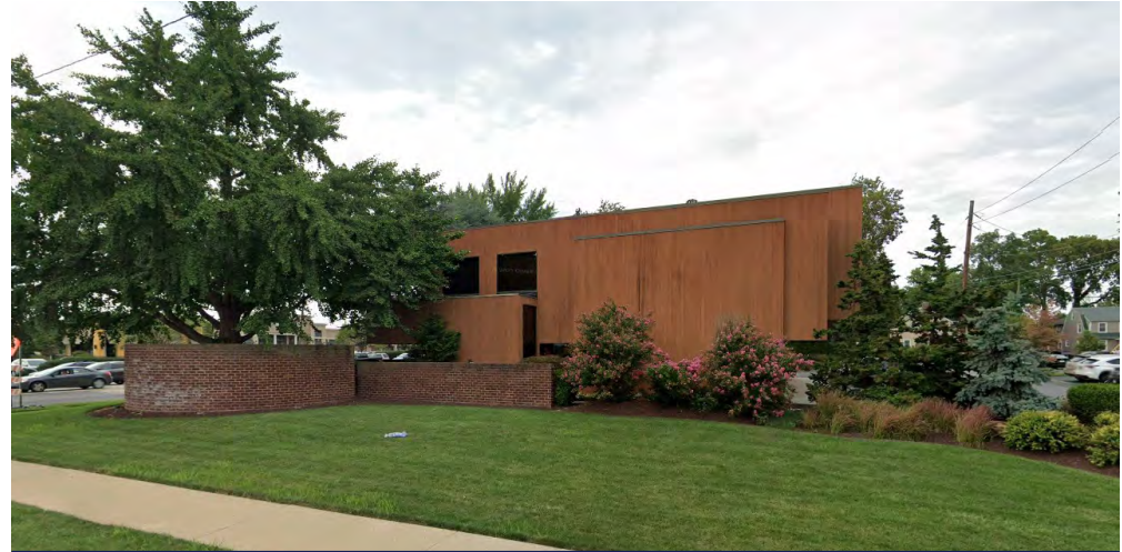
207 S 32ND ST @ 3121 YALE AVE, CAMP HILL, PA 17011 ±7,400 SF 2-story medical office building plus 14 parking spaces