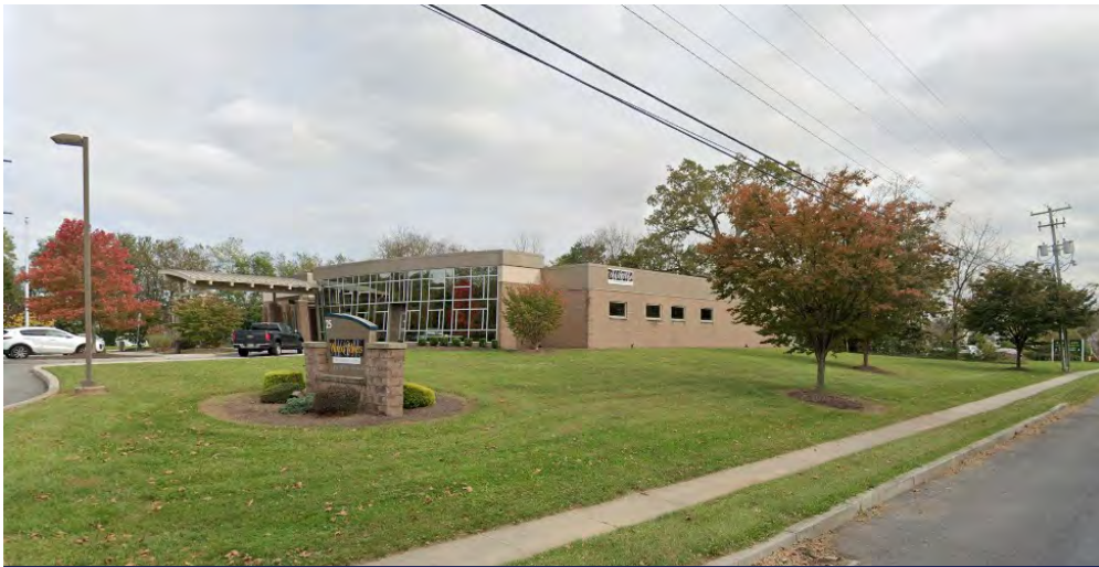
25 EASTGATE DR, CARLISLE, PA 17015 ±15,000 SF medical office building