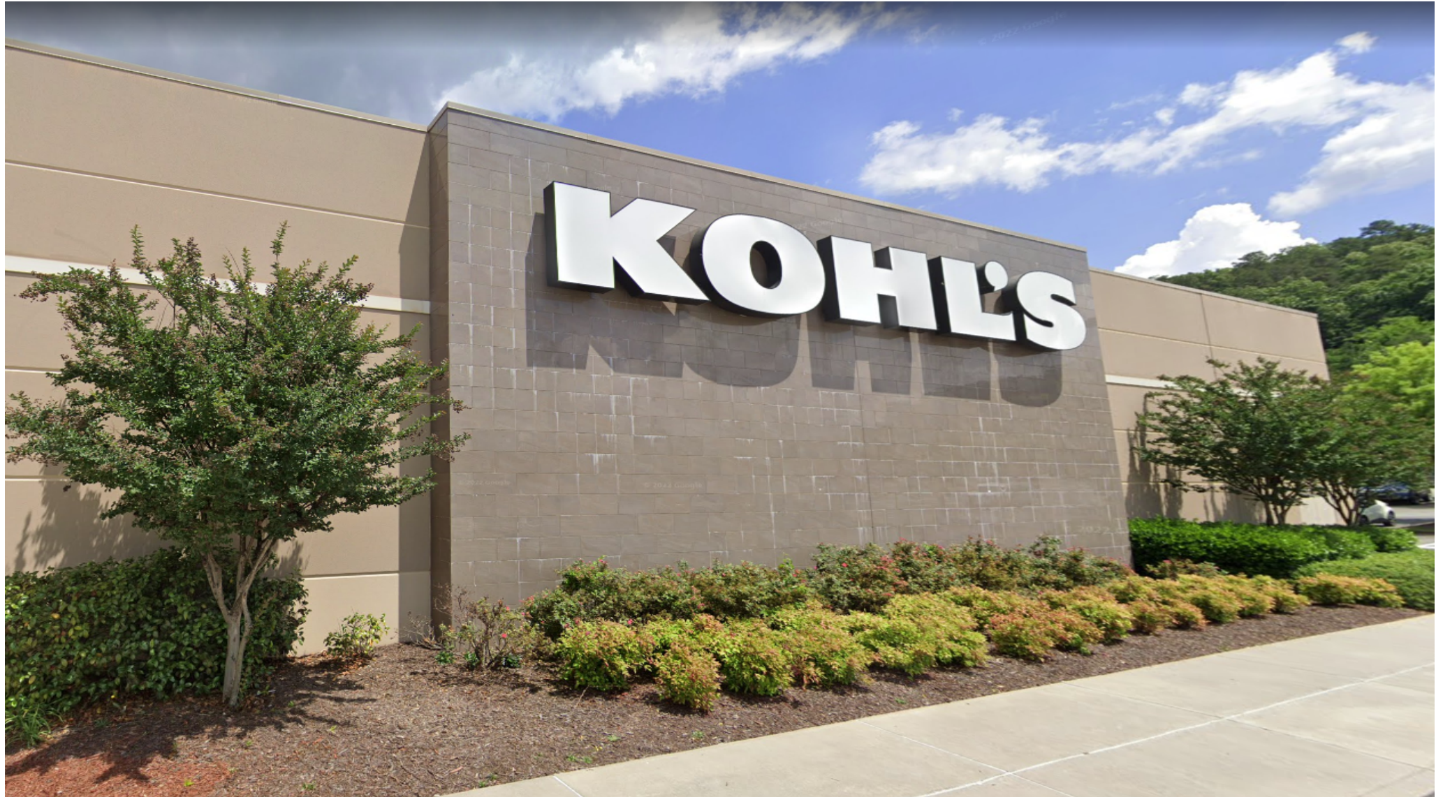
Anchor Tenant - Exterior Building Photo