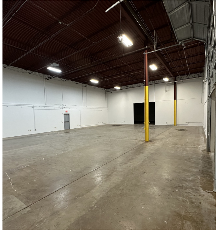
Newly Painted Walls in AC Warehouse