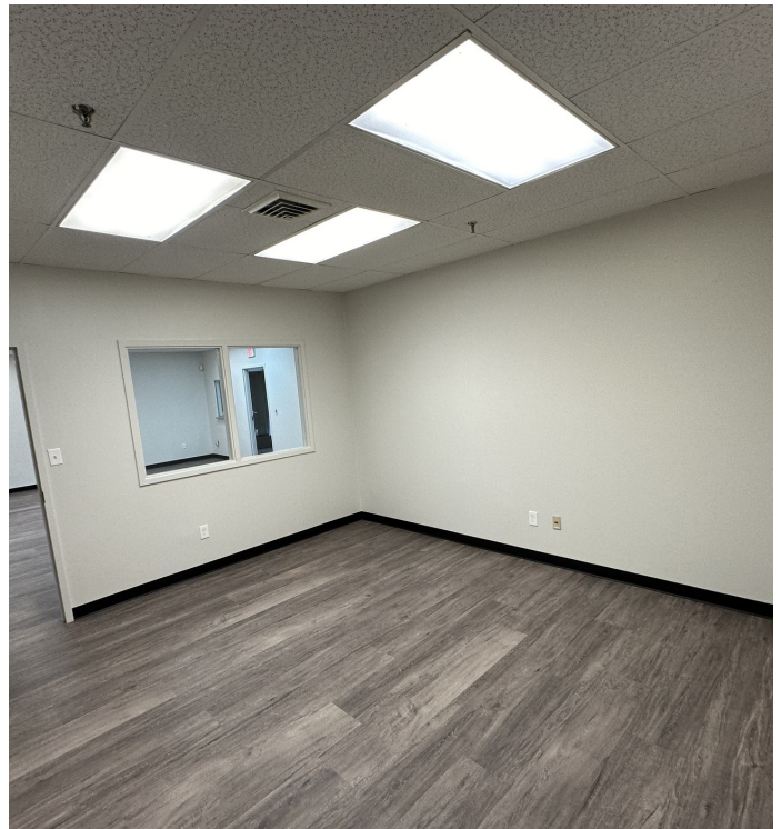
Renovated Office with New Paint + LVT