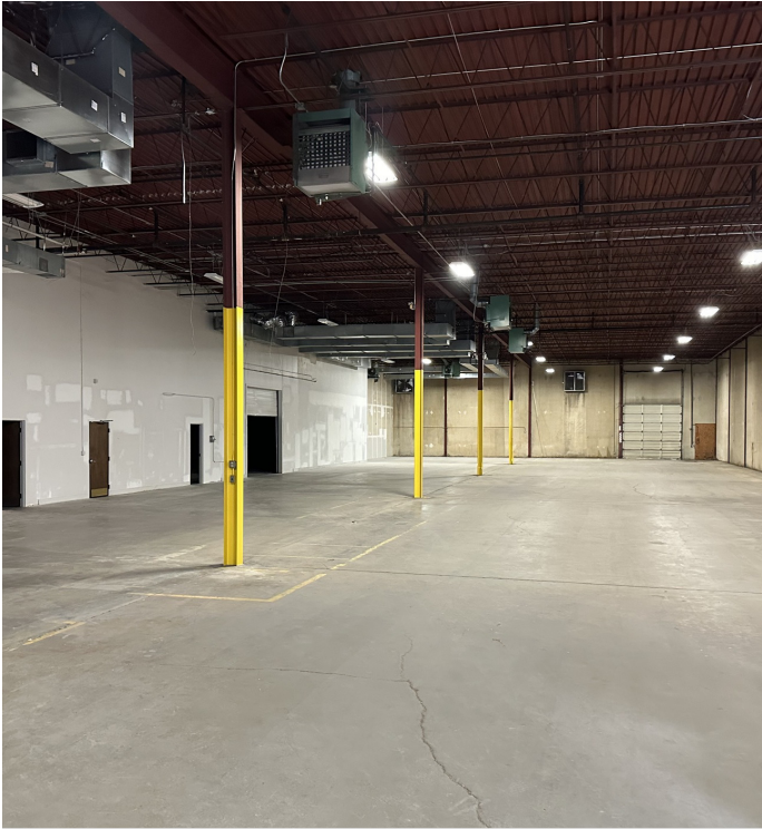
Newly Painted Wall