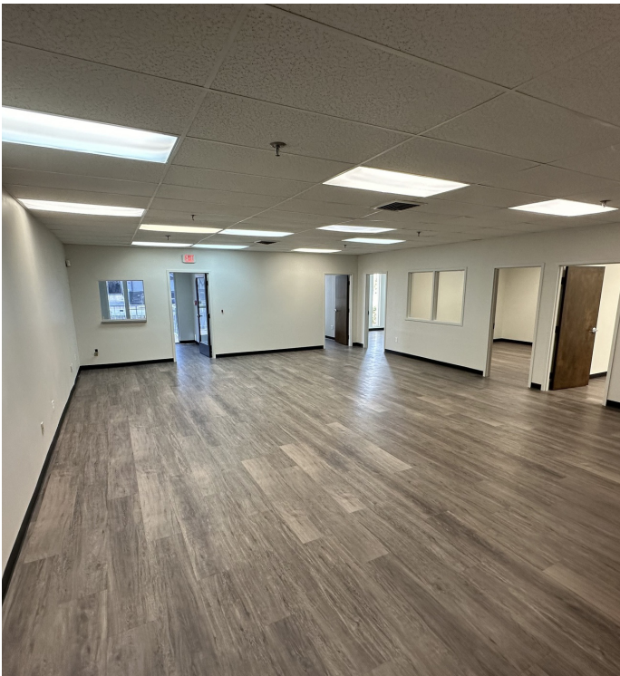
Renovated Office with New Paint + LVT