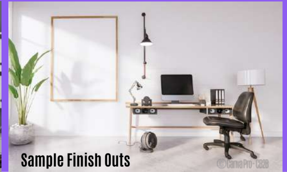
Sample Finish Outs