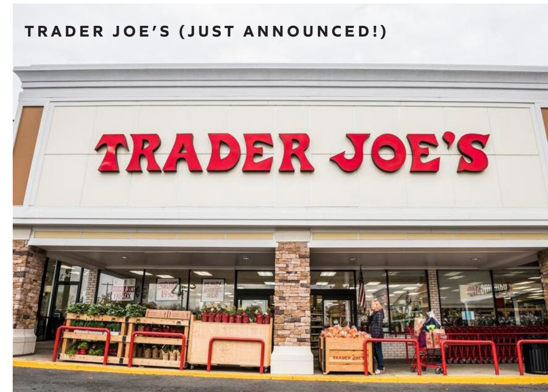
POWAY / CALIFORNIA