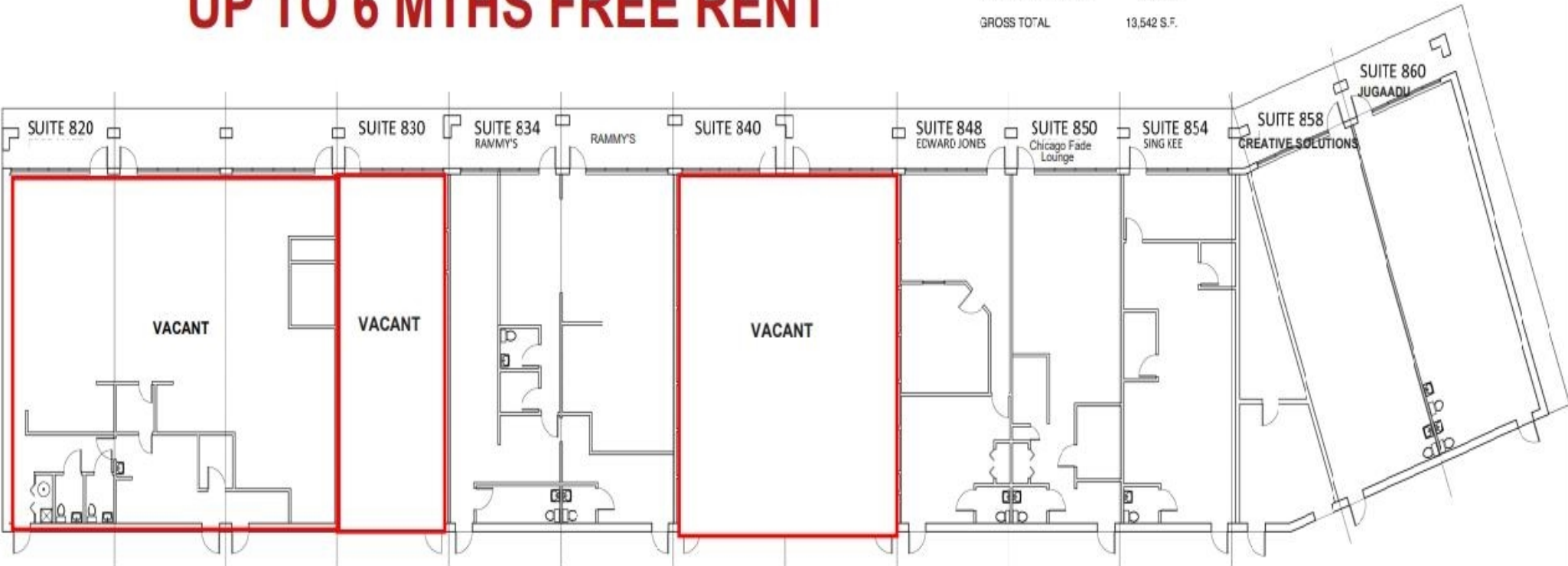
1 MAIN FLOOR PLAN 3/64"=1'-0"